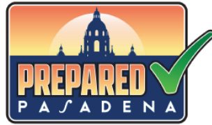
Register at: Bit.ly/PreparedPasadena26

Prepared Pasadena is the City's disaster readiness initiative to help residents survive and recover from major emergencies. The program is a 4-hour hands-on training that acts as a "Disaster 101" course, covering essentials like fire extinguisher use, basic first aid, and light search and rescue. Residents also learn the concepts of emergency planning, how to coordinate neighbors, what to pack in a go-bag, and where they can access reliable information. By simplifying the extensive CERT curriculum into a single morning session, it ensures that time is not a barrier to preparedness.