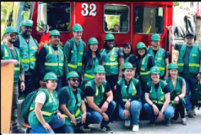
Register at: Bit.ly/PreparedPasadena26