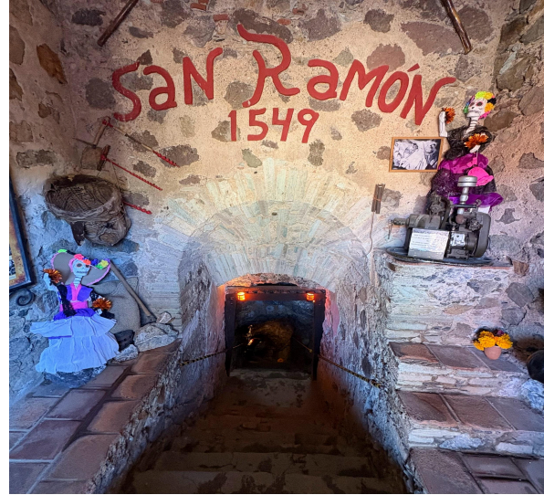
Above: Panoramic View of Guanajuato and San Ramon Mine entry.

We proceeded with the guided tour to the San Ramon Mine, in the Valenciana mining district where the delegation had a chance to go into the mine for about 600 feet underground to get a glimpse of the mines interior, the mine chronist described the slavery daily routines and the 'Raya' payment agreements from the Spanish rule era, we also learned that many modern words are actually derived from the old mining times in Mexico.