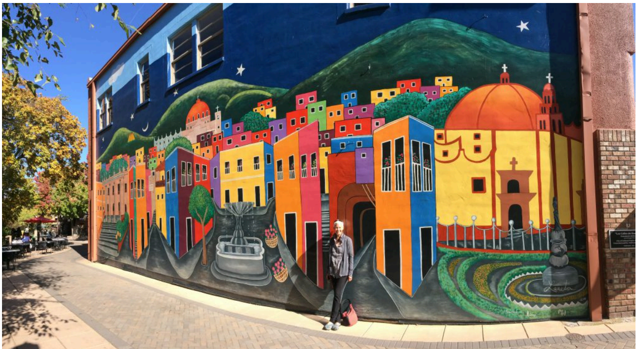
Pictured Above: Mural (The streets of Guanajuato) on Calle Guanajuato in Ashland.