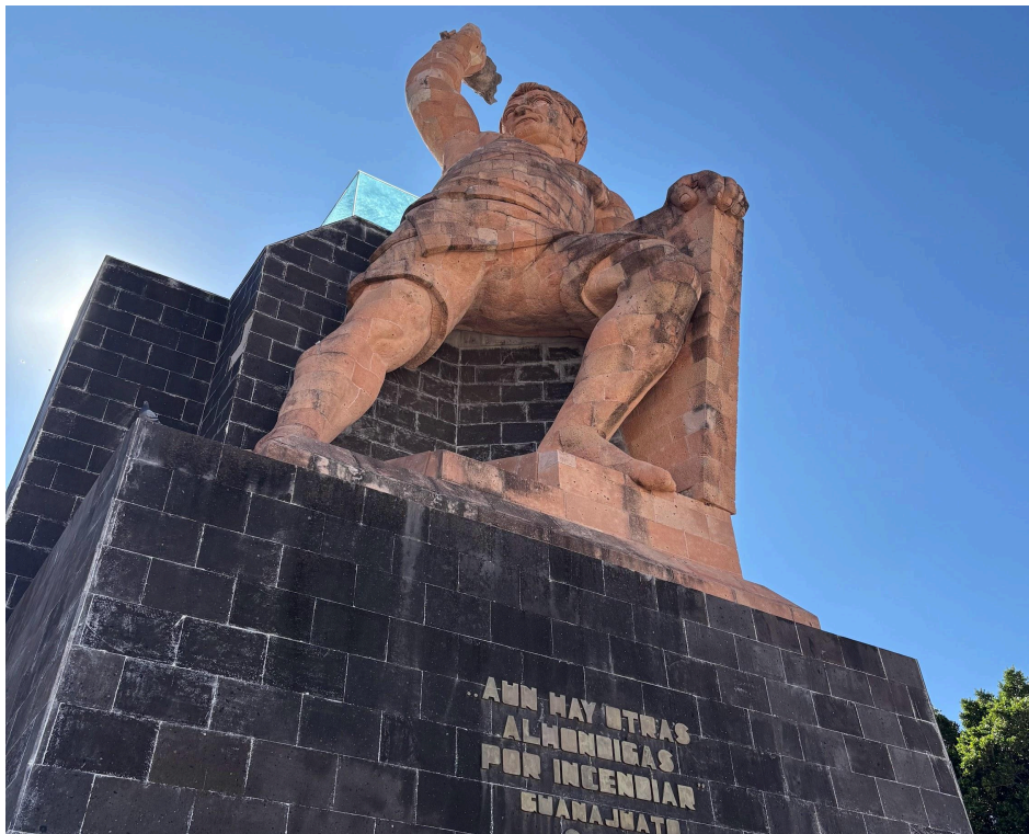
Pictures Above: A Plate on the Pipila's statue footing with a Mexican-Patriotic message in brass letters that reads: "There are still other Alhondigas to burn"