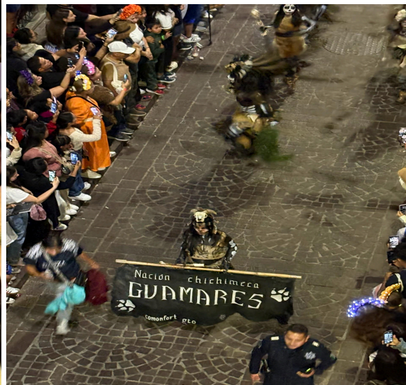
Above: Guamares-Chichimeca Nation Dancers at the Return to the Mictlan Parade.

These groups were warlike, semi-nomadic and did not practice significant agriculture, nor did they construct cities but these highly skilled warrior groups would later become instrumental in helping Hernan Cortez by joining his Army to defeat the Aztec Empire and give way to 300 years of Imperialist Spanish rule.