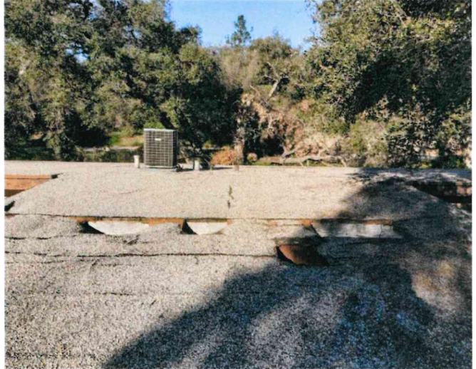
Building 2 – Roof