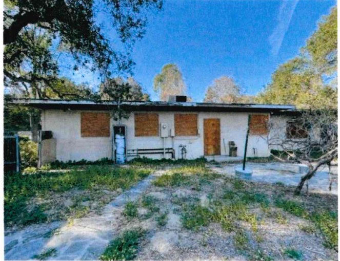
Building 1 - Backside