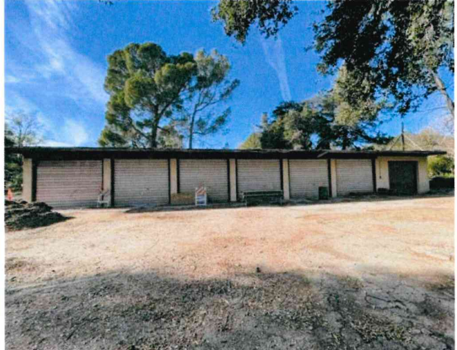
Building 6- Backside