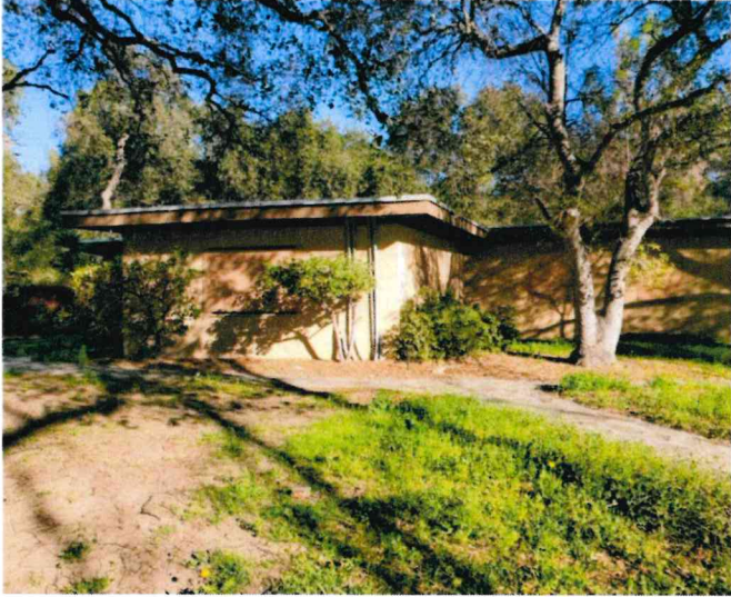
Building 3 – Exterior