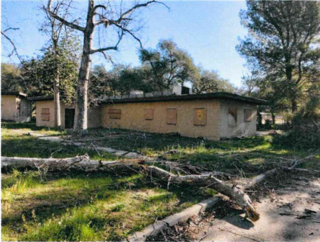
Building 5 – Exterior