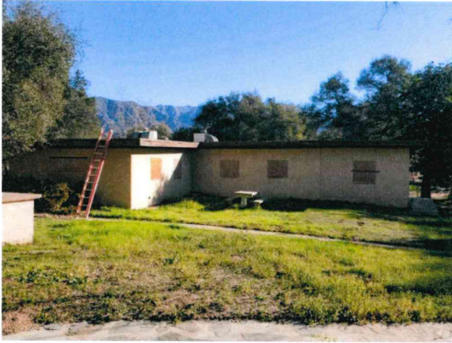
Building 4 – Exterior