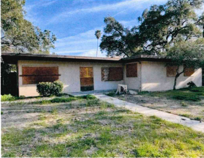
Building 1 - Front