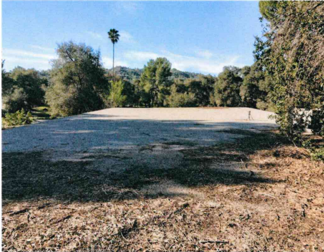
Building 6 - Roof