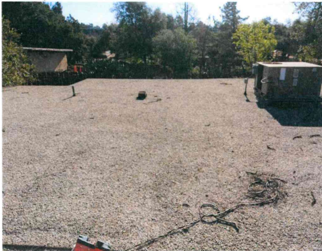
Building 1- Roof