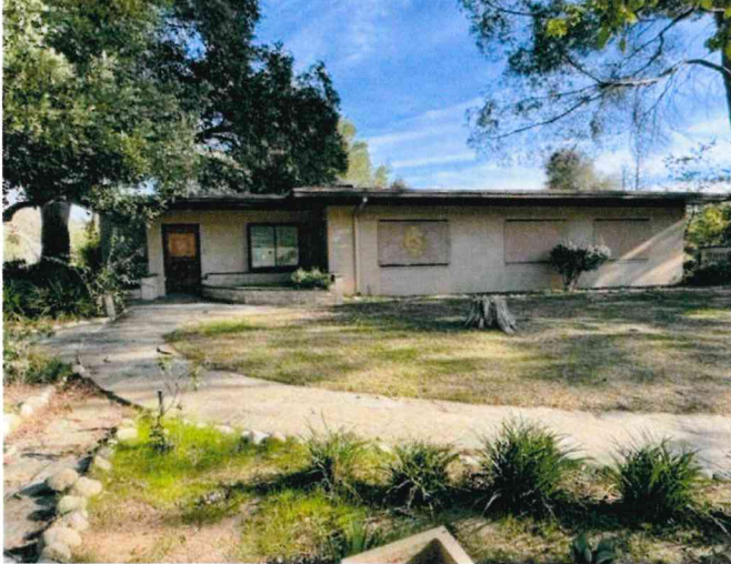
Building 6 - Front