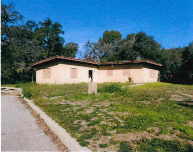
Building 2 – Exterior