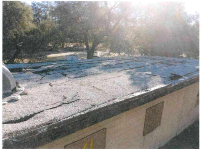
Building 4 – Roof