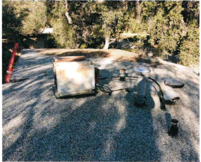
Building 3 – Roof