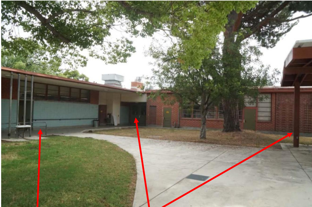
Original Main Wing

Photos below show areas of addition and enclosure of the open breezeways between the South and Center Wings and Main (east) Wing