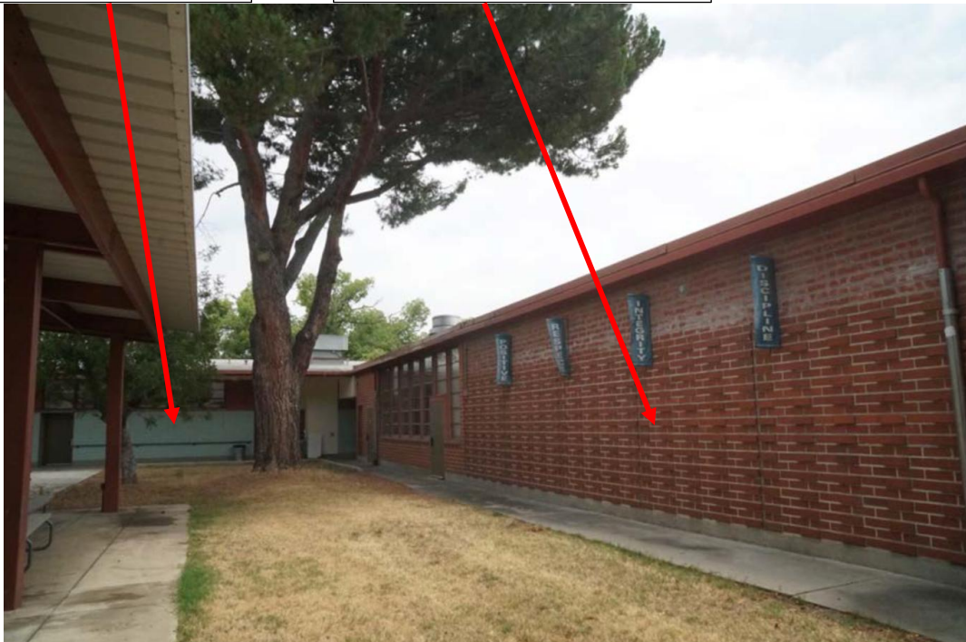
1972 Additions and Enclosure