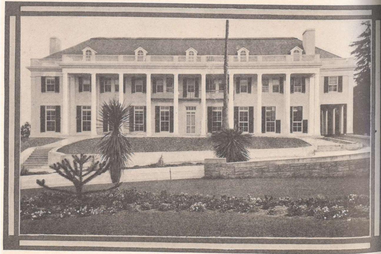
The Elks Home, Pasadena