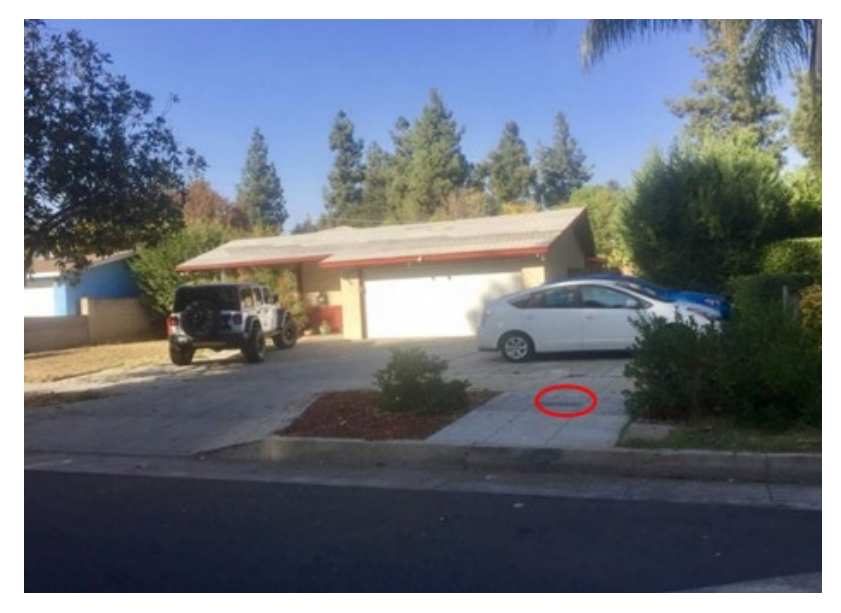
123 Pepper Street - Marker