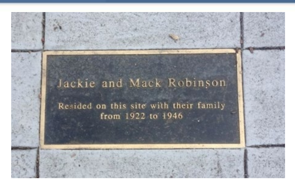
Current Marker Between Sidewalk & Curb