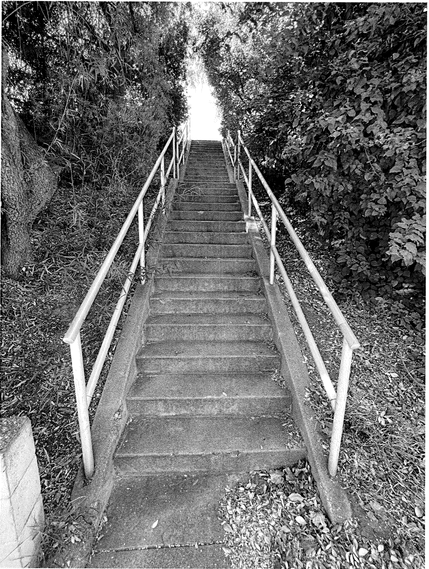
Pedestrian staircase between Rim Rd and Greenhill, from Rim Rd.