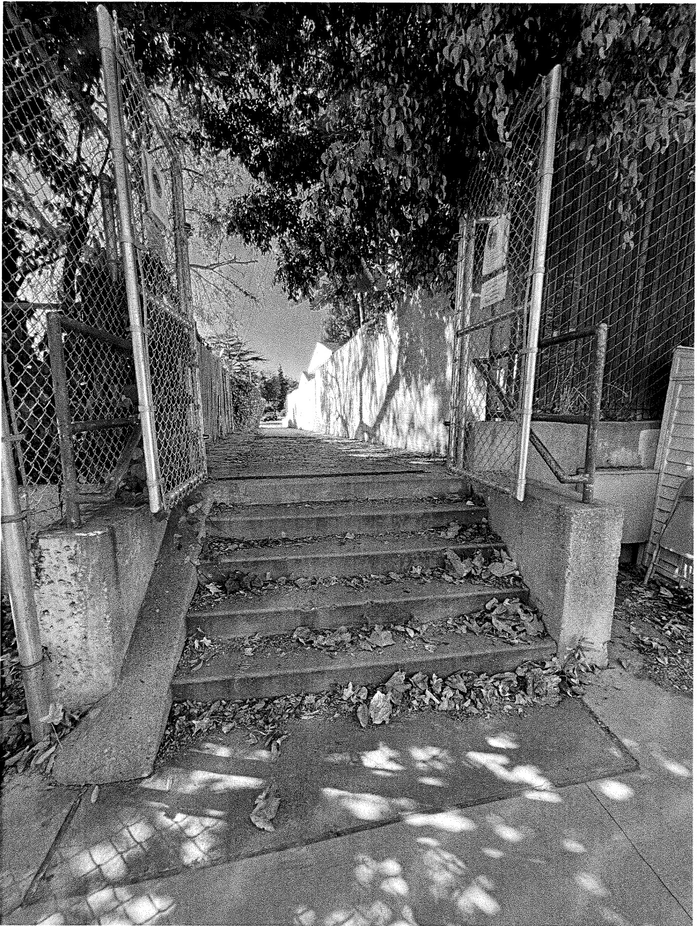
Pedestrian staircase between Rim Rd and Greenhill, from Greenhill.