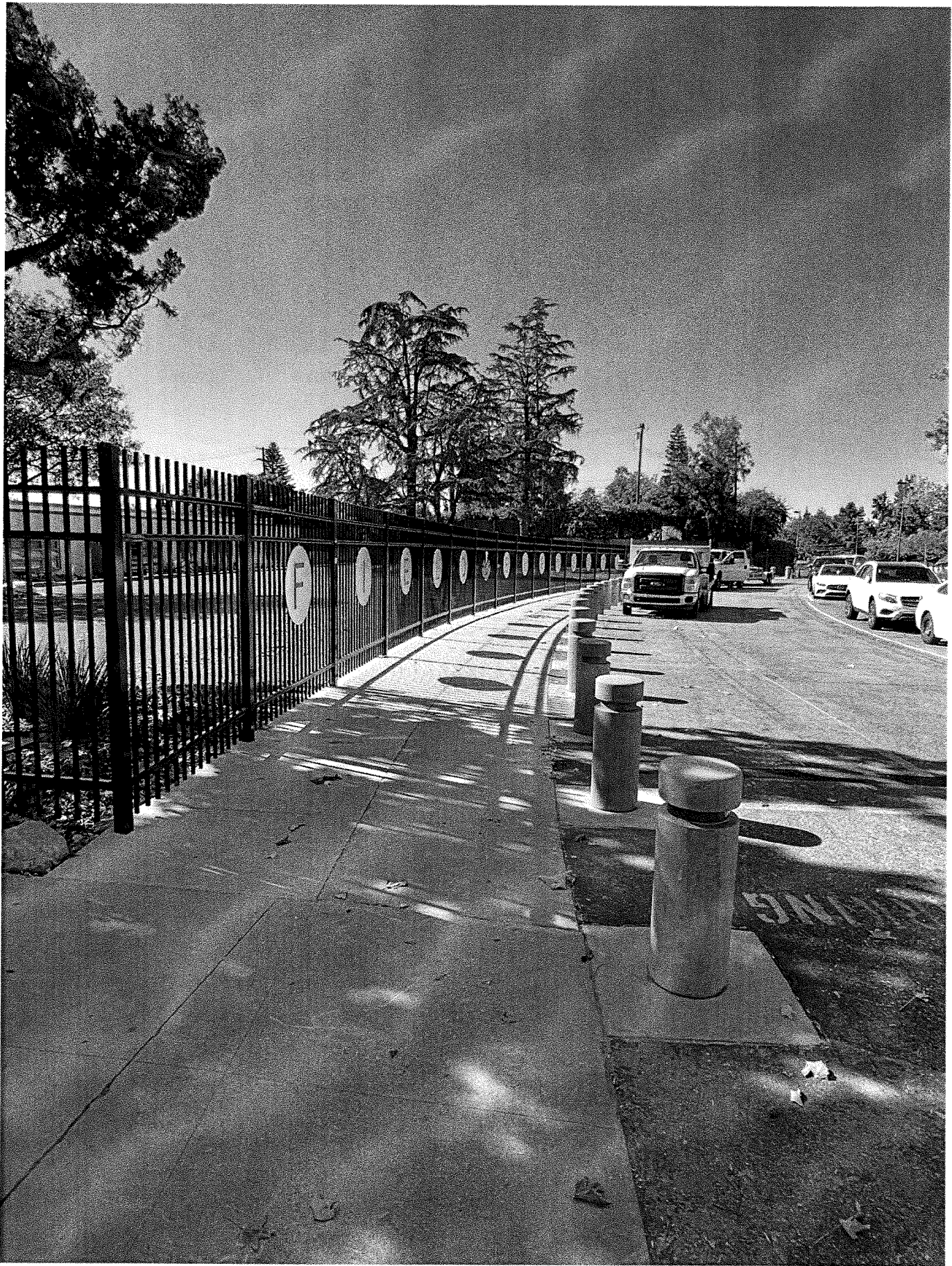
Taken from north end of walkway, facing east.