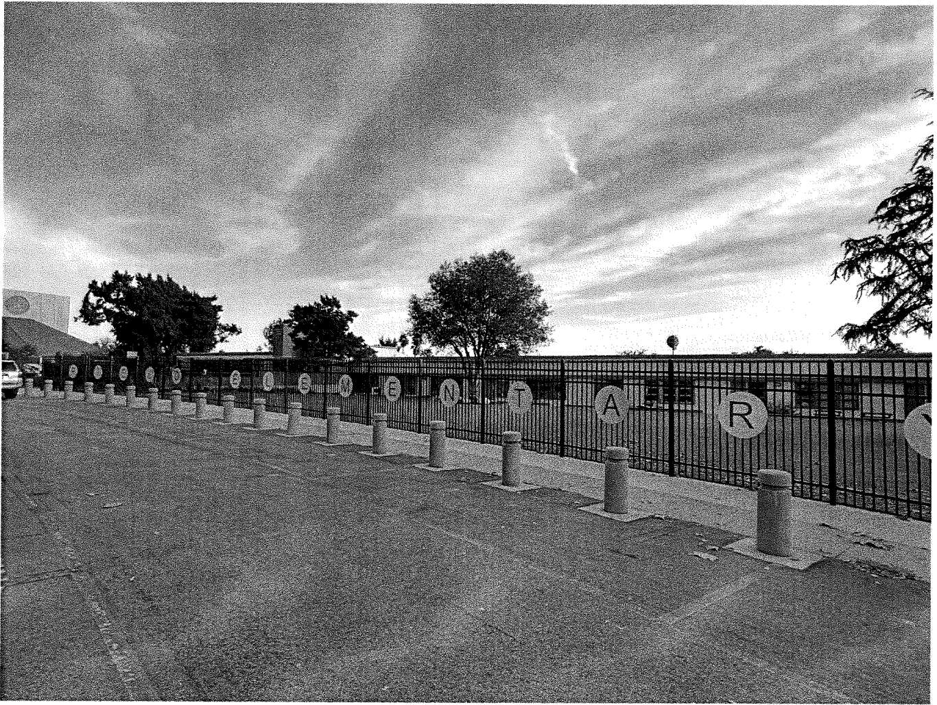
North end of walkway, facing south.