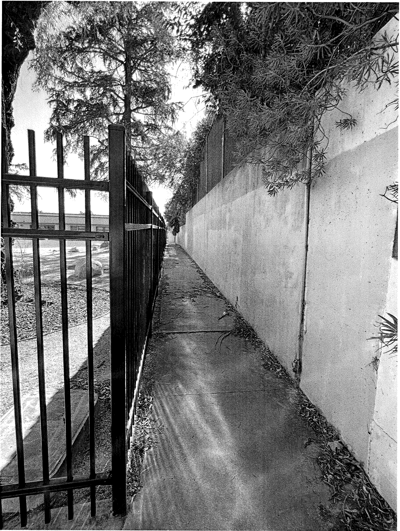
Next to stairs, facing north.