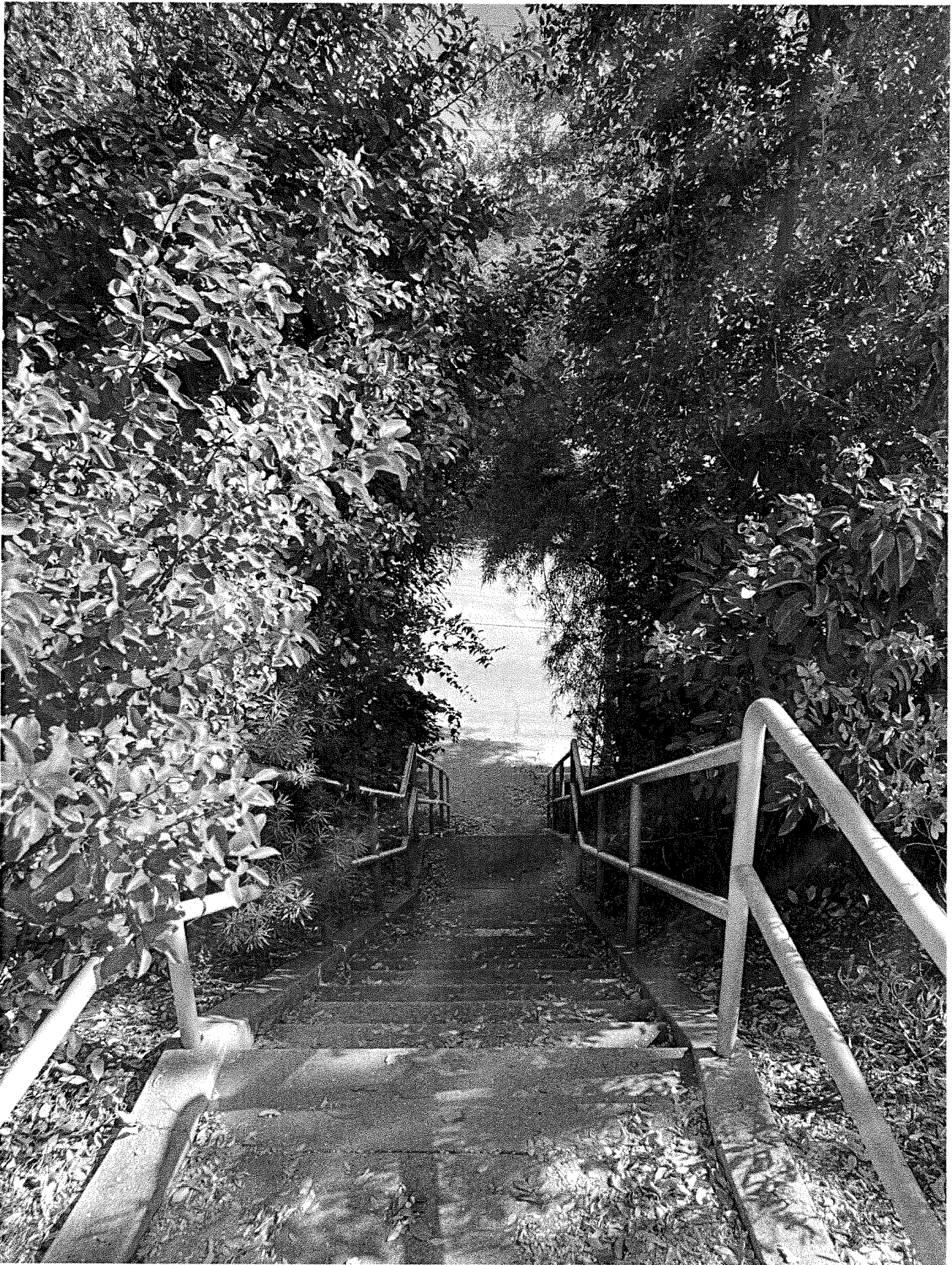
5 second timelapse video of the full walkway.