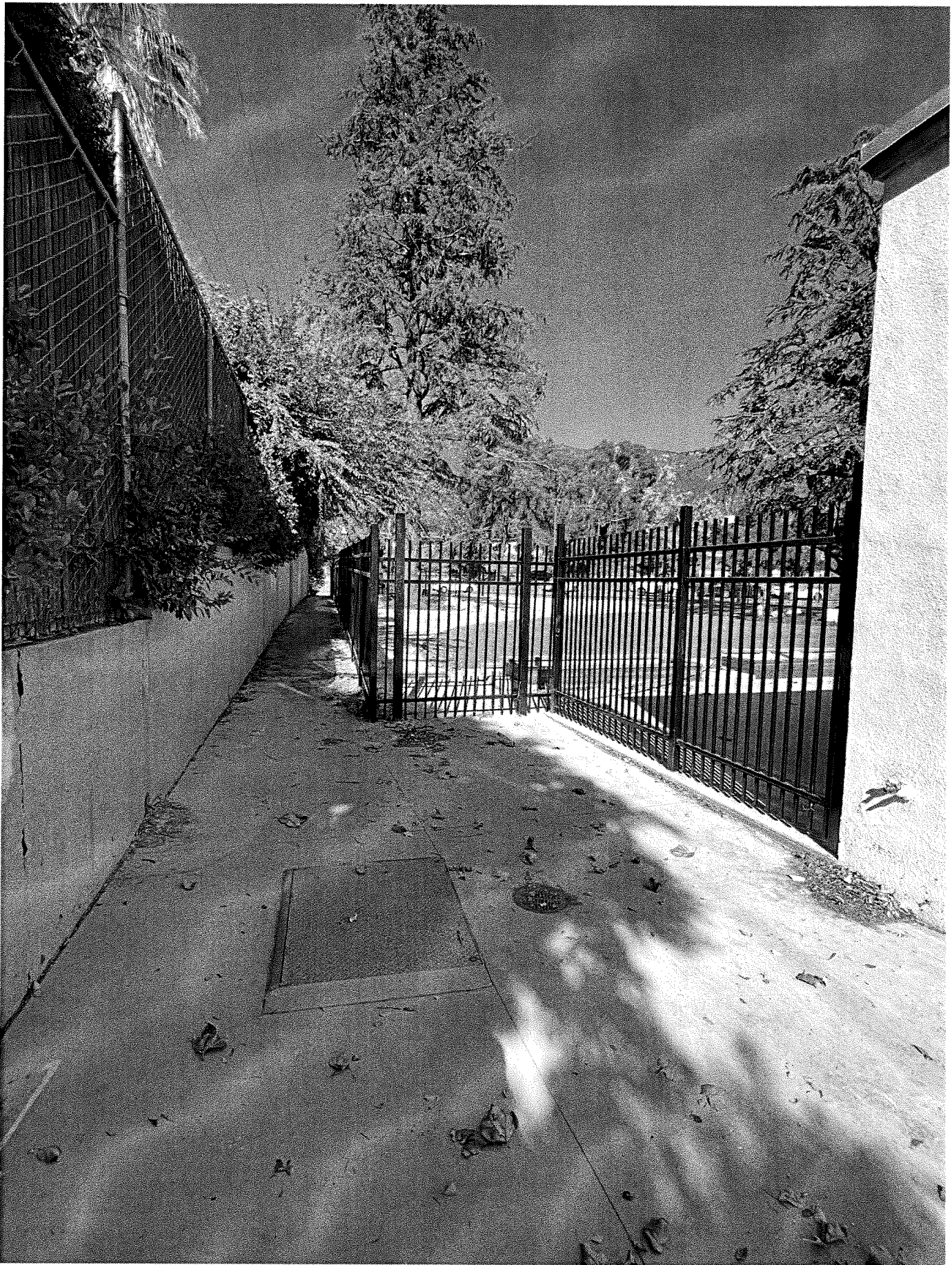
At stairs, facing west toward Rim Rd.