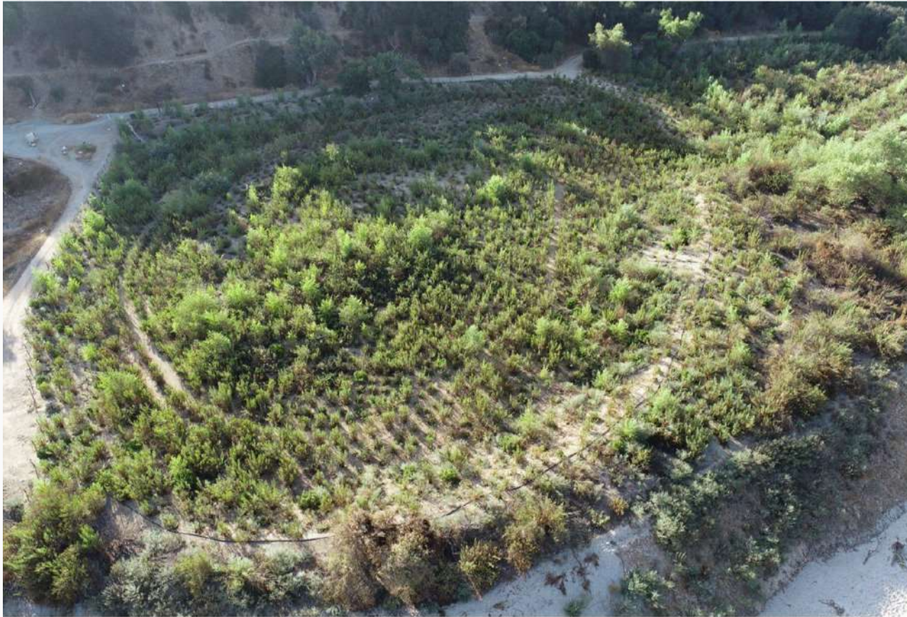
Johnson Field After Restoration - September 2022