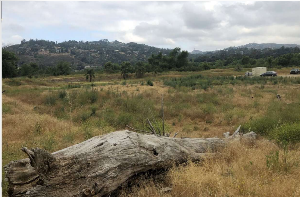
Johnson Field - 2019