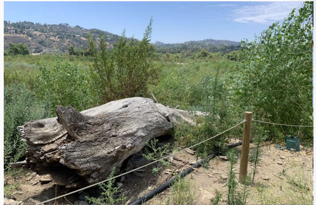
Johnson Field - 2022