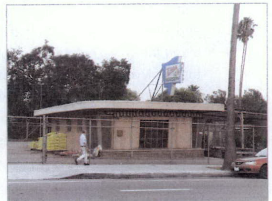
The restaurant stand, as it stands now.

I would love to see something like an Afters Ice Cream or Truck & Trowel Hamburgers occupy this space, or a food truck-type business that's looking to open their first brick & mortar establishment. A well-lit patio adjacent to the restaurant stand that serves as a connection to whatever new development is added to the Kettle's Nursery site would be welcoming. The area behind the restaurant stand can help serve as a parking area for all Kettle's Nursery site potential developments, and possibly overflow from Home State.