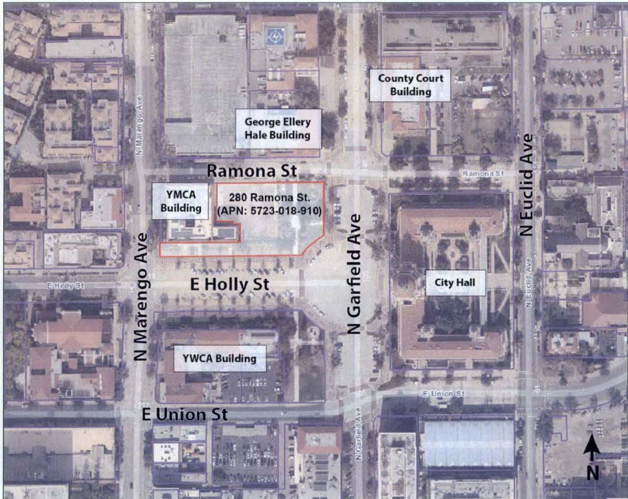
Figure 1: Aerial View of Existing Site and Context

The provision of a semi-public courtyard accessible from the main corner entrance at Garfield and Holly is consistent with the pedestrian- and civic-oriented vision of the area and will encourage more activity along the street. Staff comments to the applicant note that further attention be given to the design of this corner, particularly to address the setback options identified in the Civic Center Report by OLIN Partnership ("OLIN Partnership Report") and alignment of the building with the YMCA building along Holly Street. The proposed location of all project parking below grade with a single vehicular entry along the secondary frontage on Ramona Street minimizes the visibility of parking