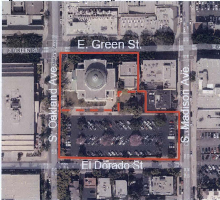
Figure 1: Aerial View of Existing Condition