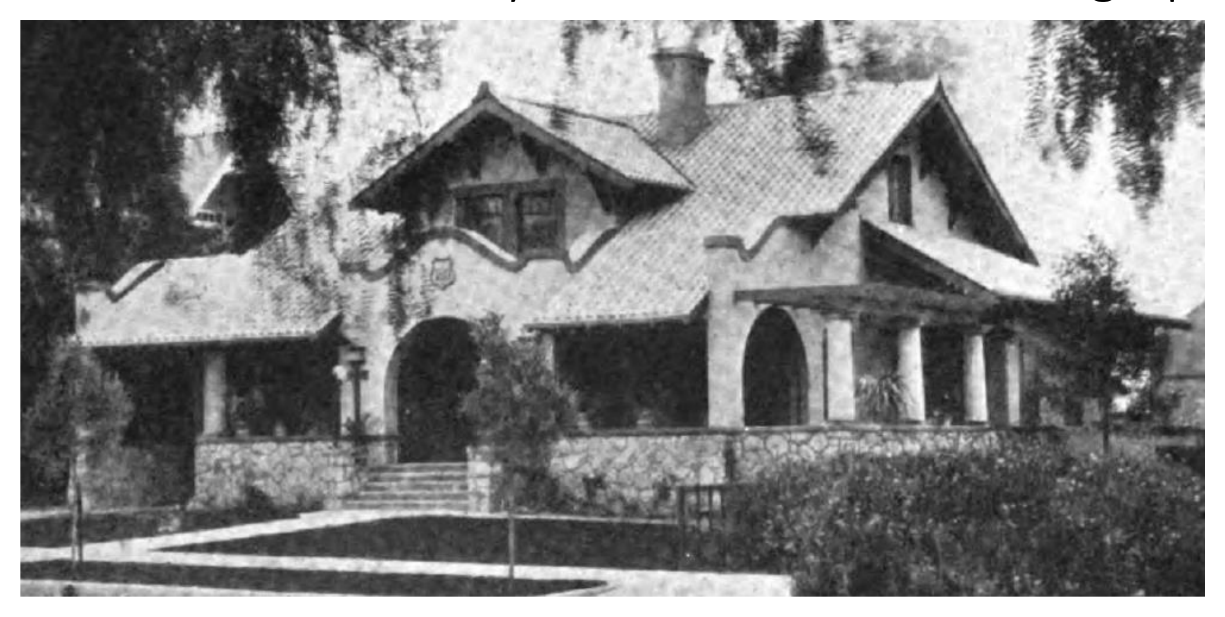
Published in Western Architect & Engineer, 1908