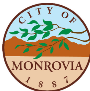
CITY OF MONROVIA Mayor Pro Tem Larry Spicer