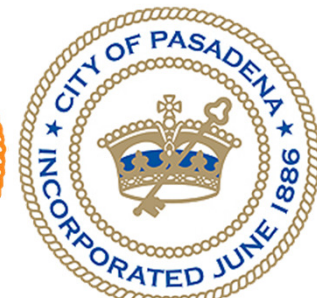
Vice Mayor Tyron Hampton