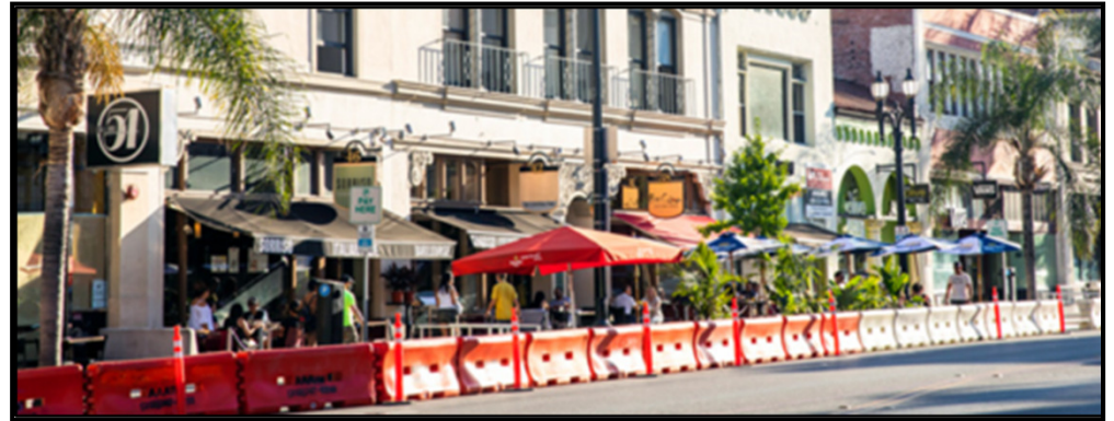
Old Pasadena On-Street Dining