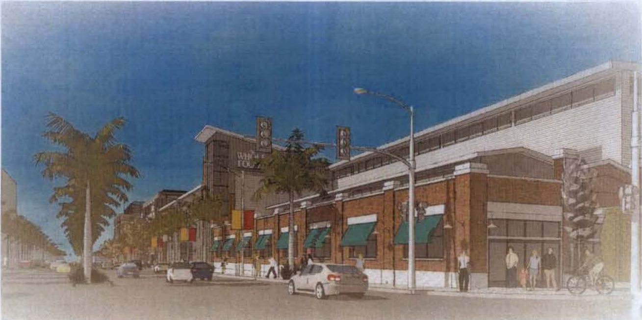
Arroyo Parkway: Looking southwest, from Bellevue Drive intersection, towards existing Whole Foods, with assisted living facility in the background.