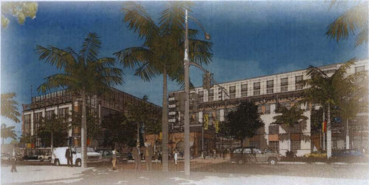
Arroyo Parkway: Looking southwest towards proposed medical office building, with assisted living facility in the background.