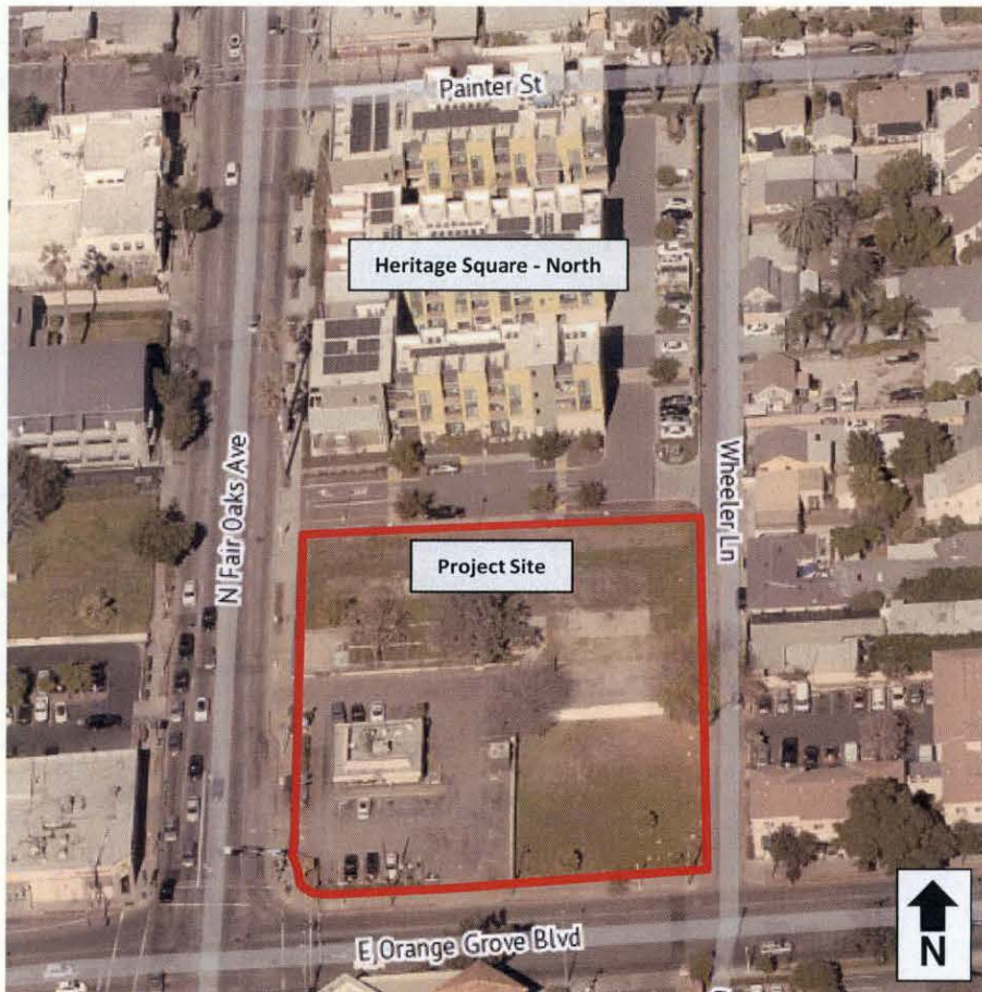
Figure 1: Aerial View of Project Site