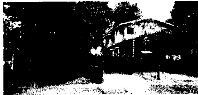
Mansionization in Bungalow Heaven: House on right (before) (During construction today and out of scale with neighborhood)