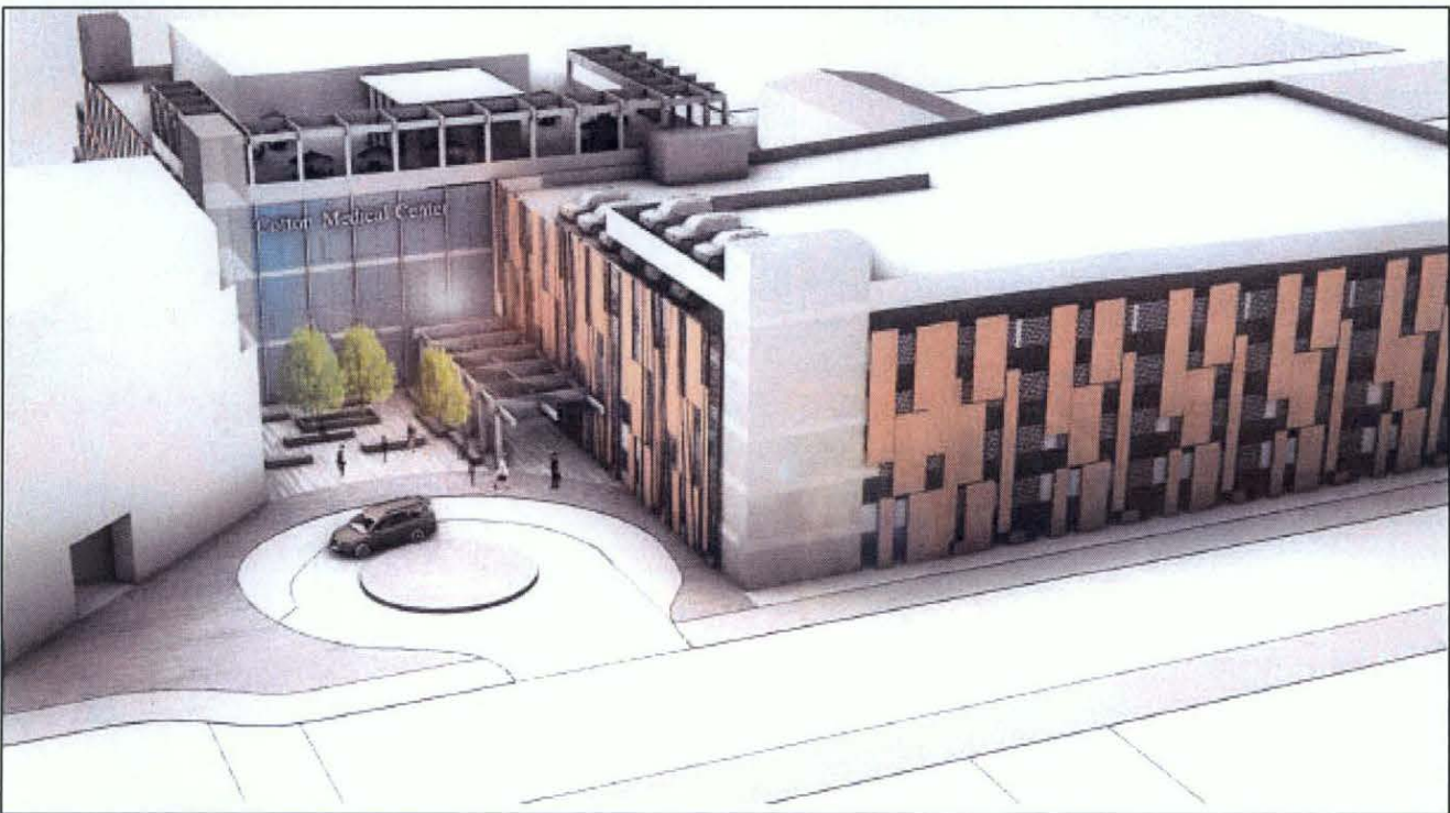
Alessandro Place: Looking southwest, towards parking structure and office building.