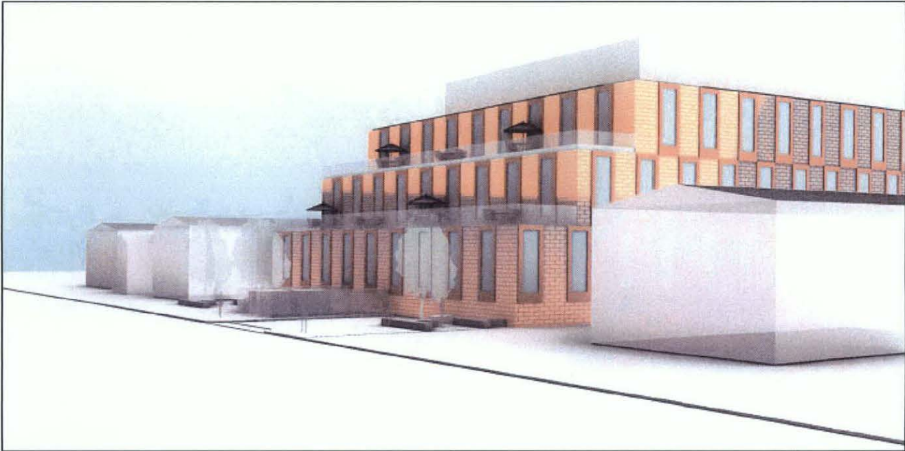
Hurlbut Street: Street view, looking northwest.