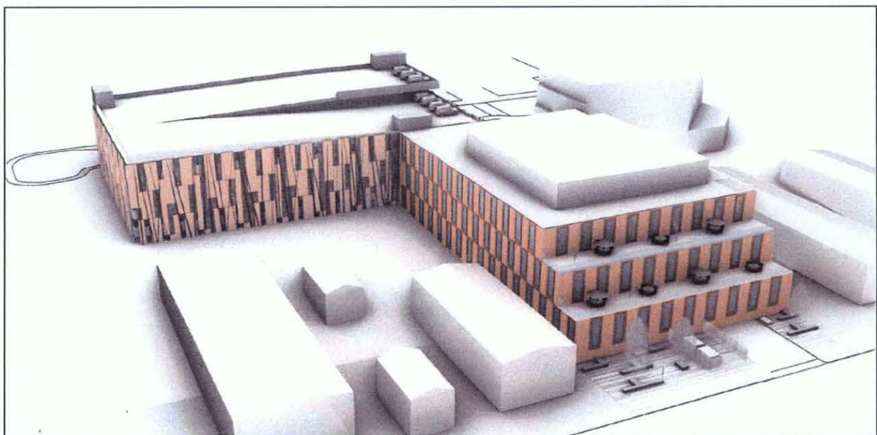
Hurlbut Street: Looking northeast towards the proposed medical office building, with parking structure in the background.