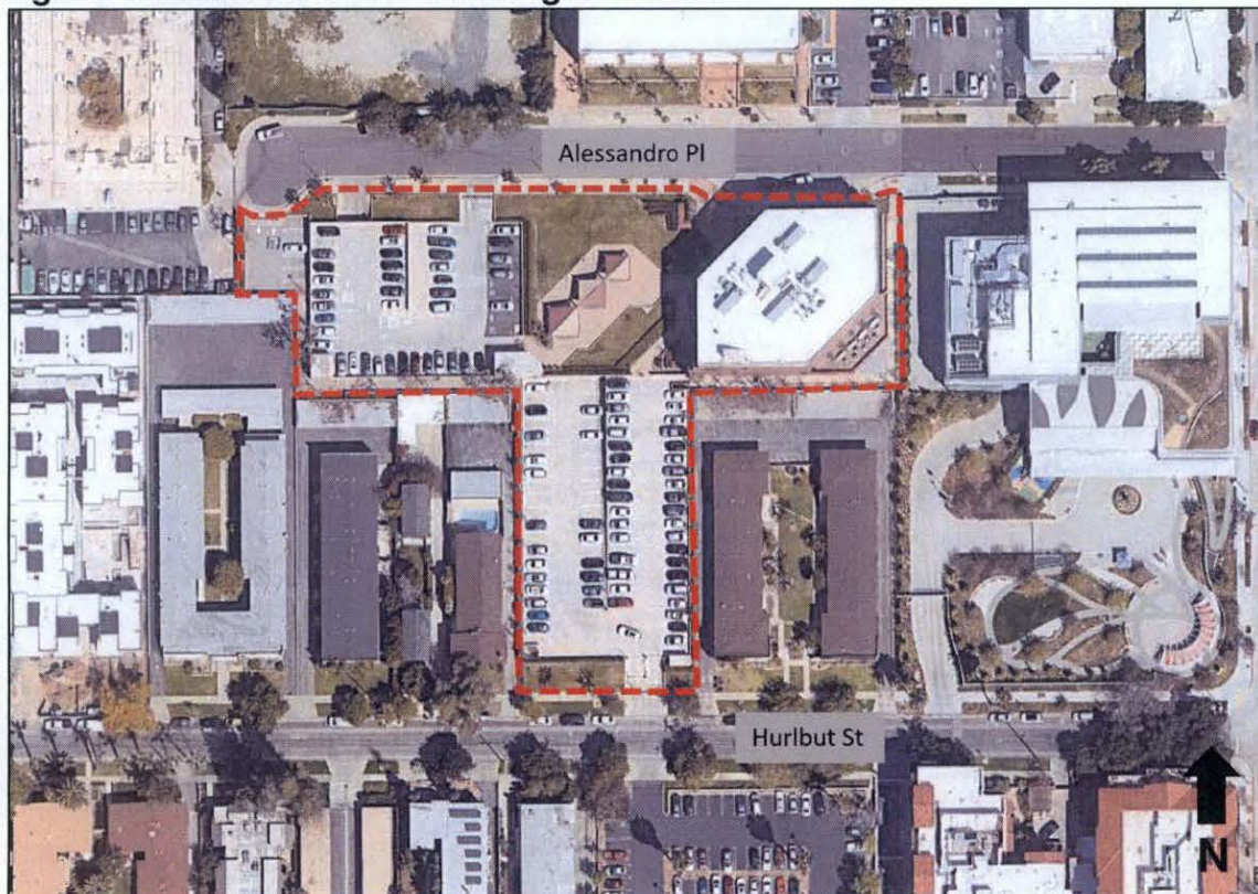
Figure 1: Aerial View and Existing Conditions