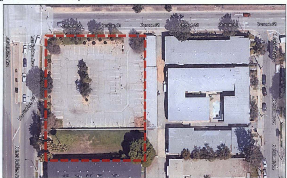
Figure 1: Aerial View Project Site