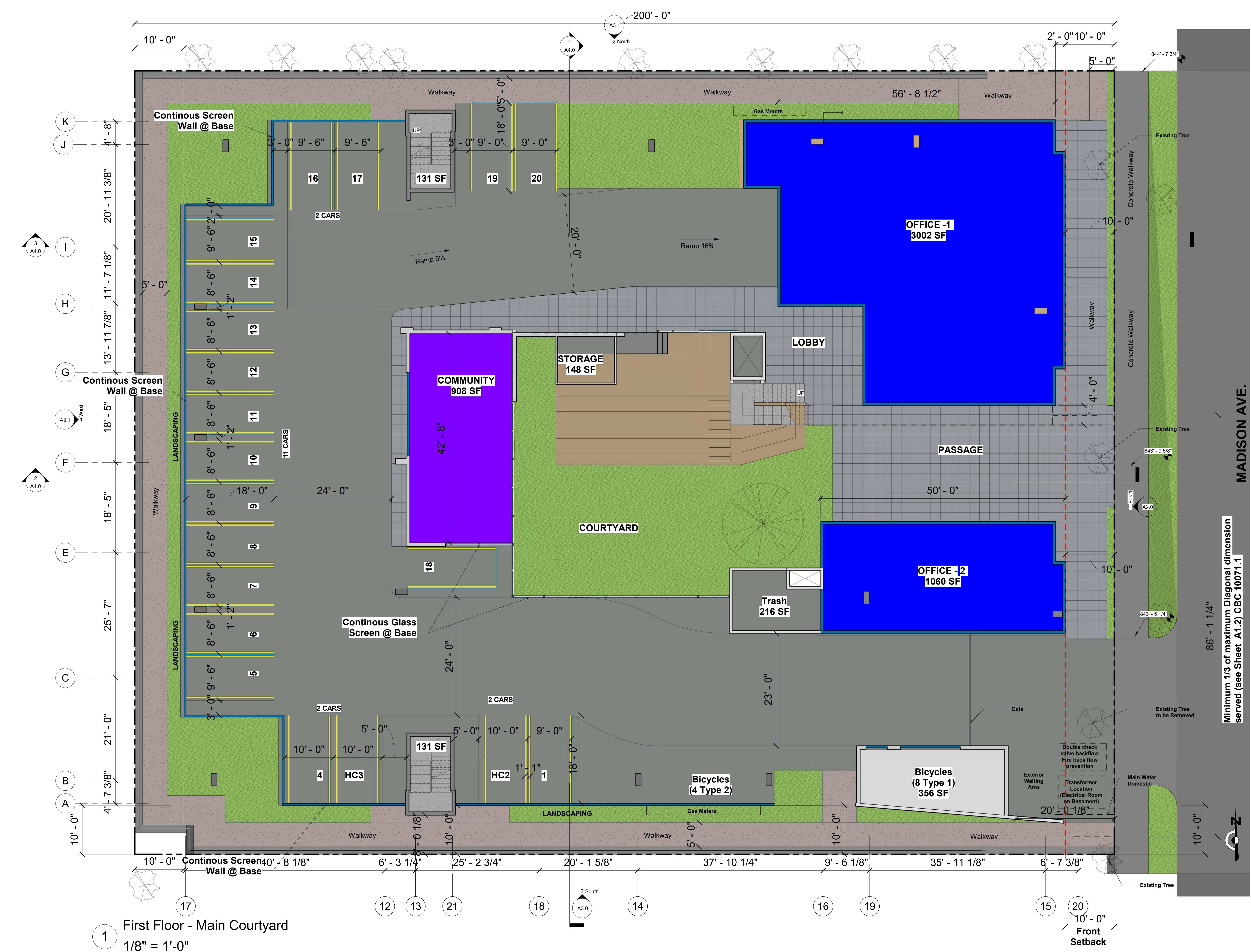
1 First Floor - Main Courtyard 1/8" = 1'-0"