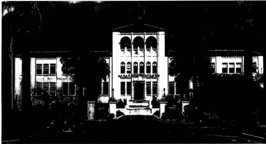
McGavran Hall, view north from Howard Street, c. 1930s. Note the gate, now removed.