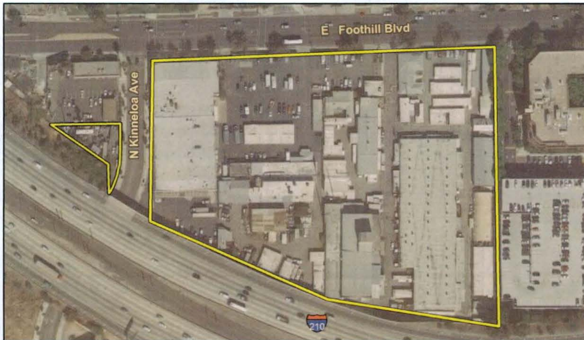
Figure 1 – Project Site