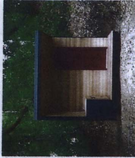
Inspiration for natural design outdoor restrooms