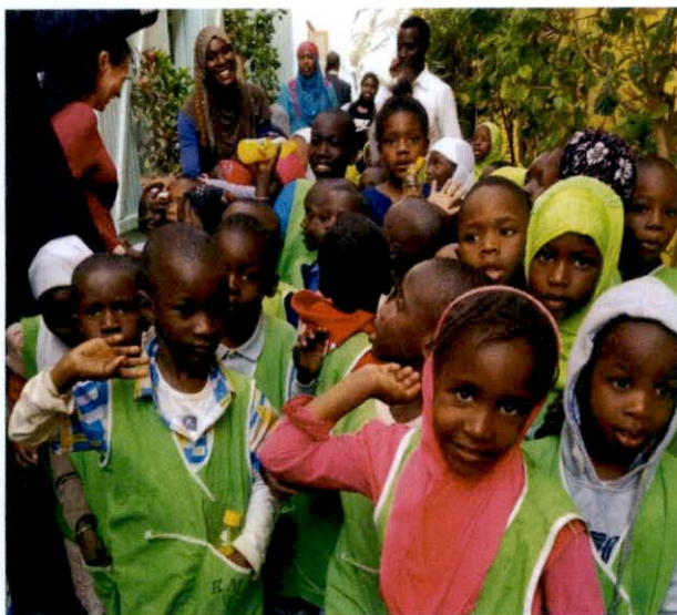
Preschoolers on a class trip to Gorée Island

The children at each school and site around the city we visited were excited about school and their education. Their eager dedication to learn, contribute and succeed is what stood out the most as we spoke with young people during our trip. Two young boys and one girl expressed their desire to be President of Senegal. The energy of the young people of the great city of Dakar Plateau was evident and strongly felt across the city from elementary school through college.