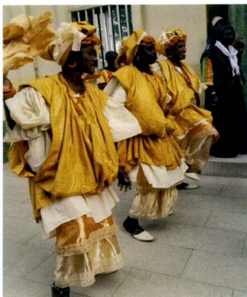
Lebou dance ensemble

The fact-finding mission to Dakar, Senegal took place in a respectful, thoughtful and supportive environment. Mr. Alioune Ndoye, Mayor of Dakar Plateau, personally welcomed the delegation at the brand-new Blaise Diagne airport, which had been inaugurated in December 2017. Shortly afterwards, we headed to a restaurant in town which the mayor requested to stay open late into the night to feed our tired and hungry group. We were then driven to Hotel Pullman, a five star hotel, nearby. We woke up the next day to a wonderful breakfast spread on the feet-in-the-ocean restaurant deck. A light lunch followed and a limousine took us to meet the officials of City Hall. To our great surprise and excitement, we were welcomed by a traditional Lebou dance ensemble in the Senegalese drums rhythm.