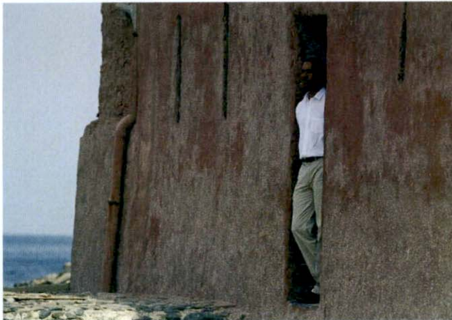
President Obama in the door of no return at La Madison des Enclaves

Pasadena has the extraordinary opportunity to establish a groundbreaking Sister City relationship with Dakar Plateau that includes Gorée Island. It is a site of pilgrimage for our African American community and an invaluable opportunity for all our citizens to learn, experience and teach our students about our histories as we bridge divides, build relationships and fostering unity among our people. The UN has a program to help Africans in the slave Diaspora trace their roots back to Africa.