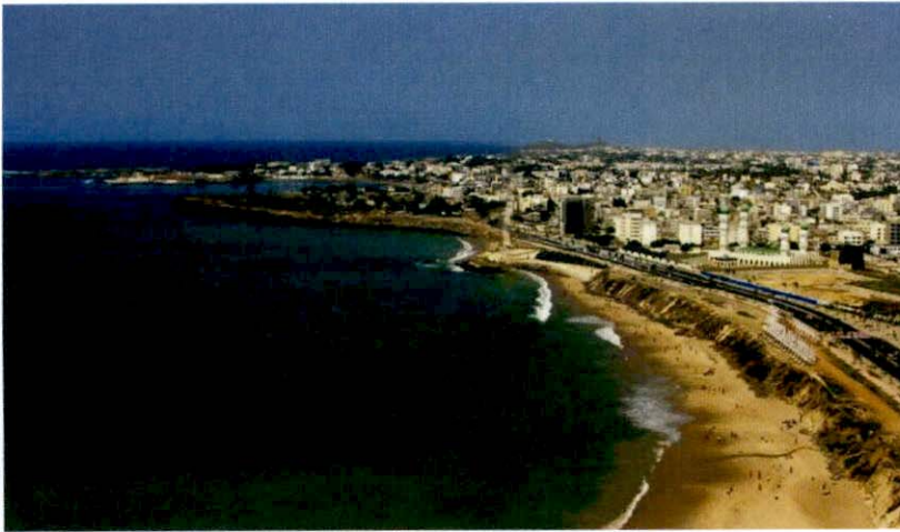
View of Dakar from the Atlantic