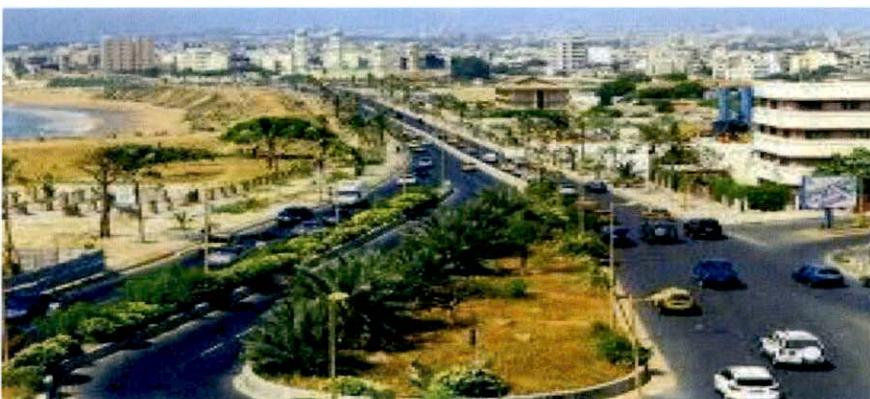
Partial view of Dakar

As the French advanced their colonial claims eastward, areas occupied by the Wolof ethnic group resisted them in the 1880s. Eventually, however, they yielded to superior military force and Dakar became an important city when the French made it the capital of their West African territories in 1902. Under Léopold Senghor who was a French parliamentarian, Senegal declared its independence in 1960 on April 4. That day is now celebrated as Independence Day.