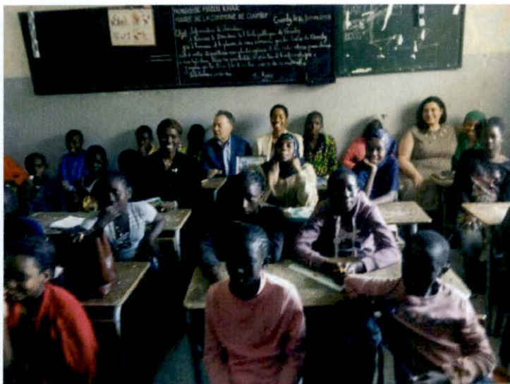
Pasadena Ad Hoc Committee with class in Dakar Plateau