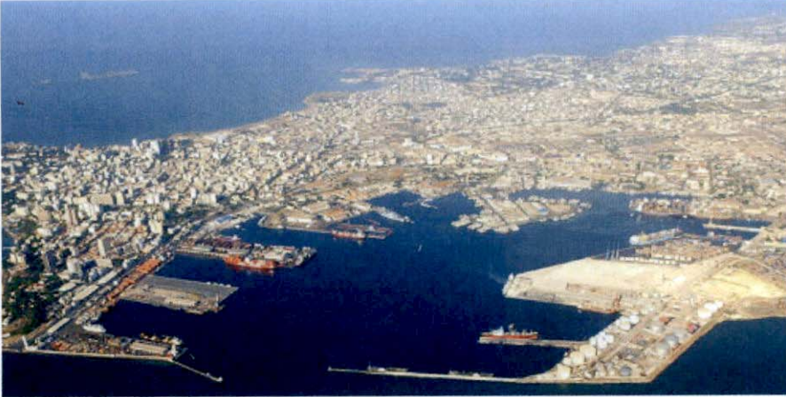
Port of Dakar

investor-friendly reforms. Over the past two years, Africa has ranked first in the world in the number of reforms enacted. African economies are now forecasted to grow 30 percent faster than the rest of the world." (Investing in a brighter Future in Senegal, 02/24/2016, U.S Development Finance Agency)