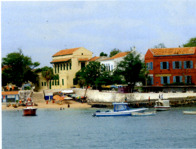
Gorée Island, partial view

The island of Gorée is a pleasant respite from the bustle of the city as well as a UNESCO monument to the slave trade. It is regularly visited by dignitaries and heads of state as well as school children from all over the country. Gorée island has been a Senegal national heritage list since 1975 and on UNESCO's World Heritage List since 1978.