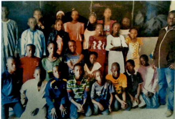
Berthe Maubert Elementary School, fifth grade.