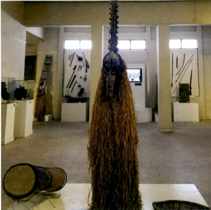
IFAN Museum exhibit

Dakar Plateau has four (4) cultural institutions