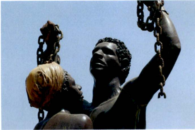
Statue outside La Maison des Esclaves

Pasadena has the extraordinary opportunity to establish a groundbreaking Sister City relationship with Dakar Plateau that includes Gorée Island. It is a site of pilgrimage for our African American community and an invaluable opportunity for all our citizens to learn, experience and teach our students about our histories as we bridge divides, build relationships and fostering unity among our people. The UN has a program to help Africans in the slave Diaspora trace their roots back to Africa.