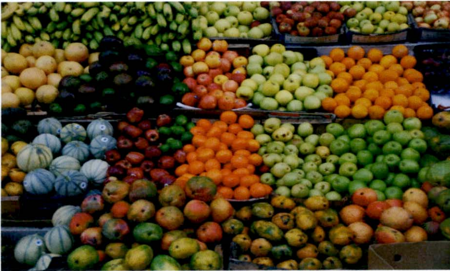
Fresh fruits in Kermel Market, Dakar

Since cultural exchanges have strong potential impacts, the positive aspect will be in the process of learning to work together. In spite of many challenges, people in Dakar Plateau are truly optimistic about creating opportunities for employment, and improvement of infrastructure. They intend to celebrate their rich history and continue in their leadership position as an exemplary African nation.