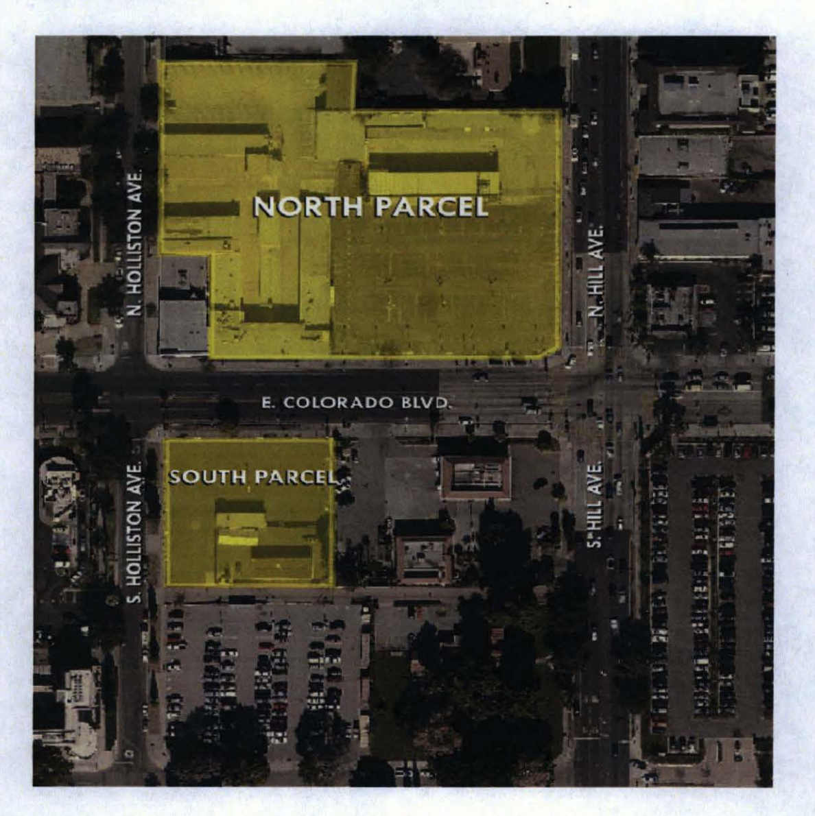
Exhibit A Colorado Hill Planned Development Zone Change December 2016