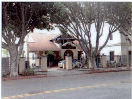
Figure 9: Context View Including Perimeter Fence.