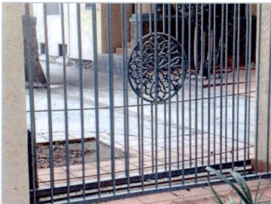
Figure 8: Arroyo Stone on Foundation.