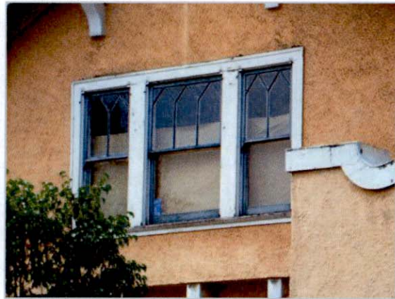
Figure 7: Original Windows on North Elevation.