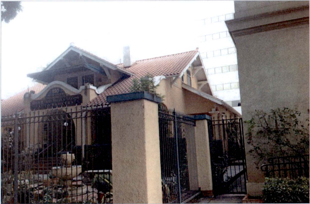
Figure 4: South Elevation. Source: GPA, November 2013.