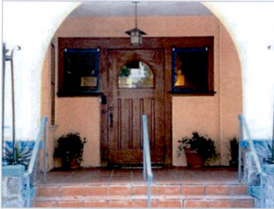
Figure 6: Main Entrance.

After the Pinney family, who owned the property through the 1930s, the building's subsequent owners included Mabel Abbott in the 1940s and various members of the Lusvardi family from the 1950s through the present. It appears to have been used for commercial purposes as early as 1951. 5