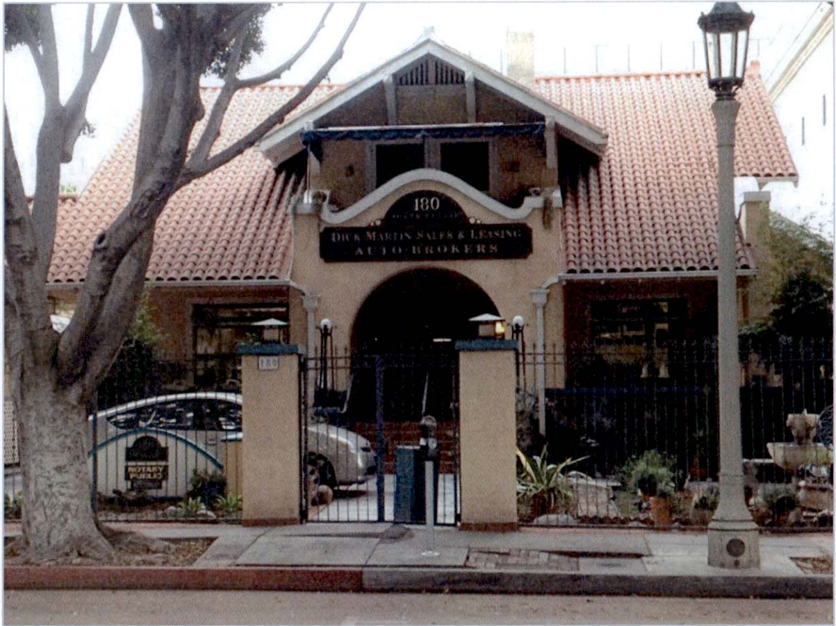
Figure 2: West Elevation.

The primary roof is side-gabled and clad with non-original metal tiles fashioned to look like clay tiles. It features decorative brackets and exposed rafter tails. The façade composition is nearly symmetrical with the exception of an offset portion of the side-gabled roof. The bottom part of the gable shifts north to form a porte cochere at the north end and cutout at the south end. Both the porte cochere and the cutout terminate at wing walls with shaped parapets oriented perpendicular to the street. Each wing wall features an arched opening. The arch on the south wing wall originally led to a trellised porch. The trellis has since been removed.