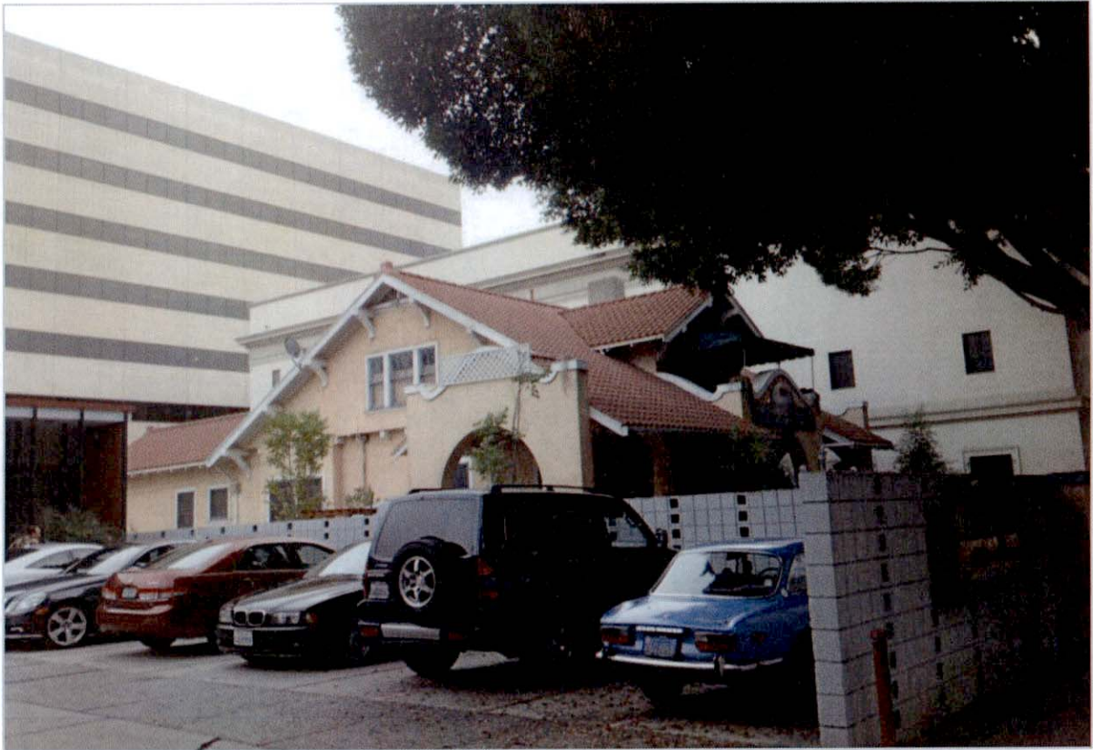
Figure 3: North Elevation.

Windows on the first story of the west elevation appear to be single fixed wood windows with leaded glass transoms. The fenestration in the balcony was difficult to see due to the deep recess, the presence of a non-original awning, and the elevation above street level; however, it appears to consist of a pair of either wood windows or glazed wood doors. According to a historic photograph of the building published in The Architect and Engineer of California , the existing windows or doors in the balcony are replacements, and the balcony originally featured a pair of wood windows with leaded glass (see Figure 5). 4 Visible windows on the north and south elevations include grouped and single double-hung wood windows, some of which have leaded glass in the upper sash (see Figures 3, 4, and 7). One window on the half story of the south elevation appears to have been replaced with glass block.