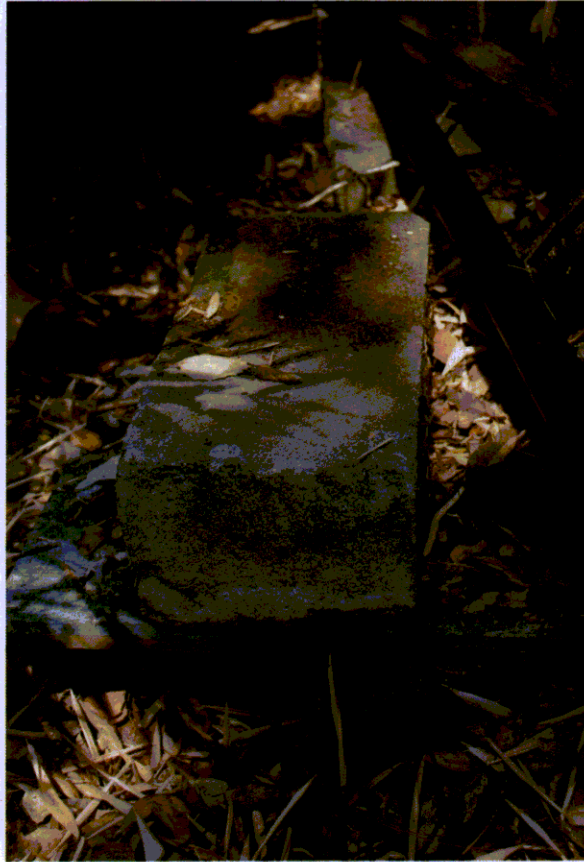
Balustrade remnant on-site