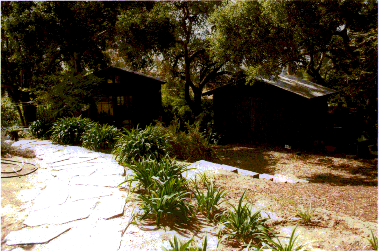
Studio and Shed (view S)