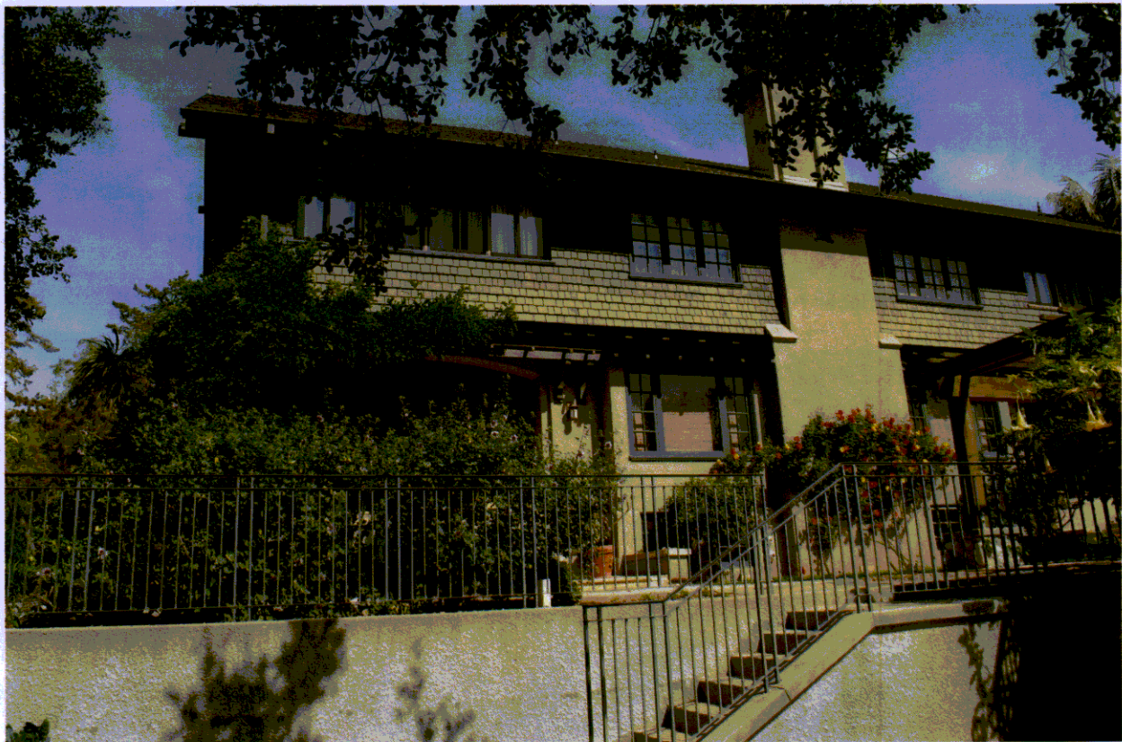
South Facade (view NE)