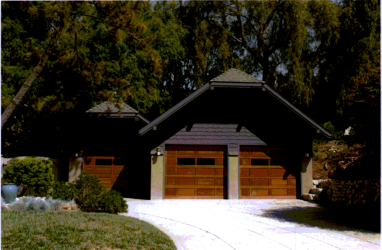
Garage (view N)-2