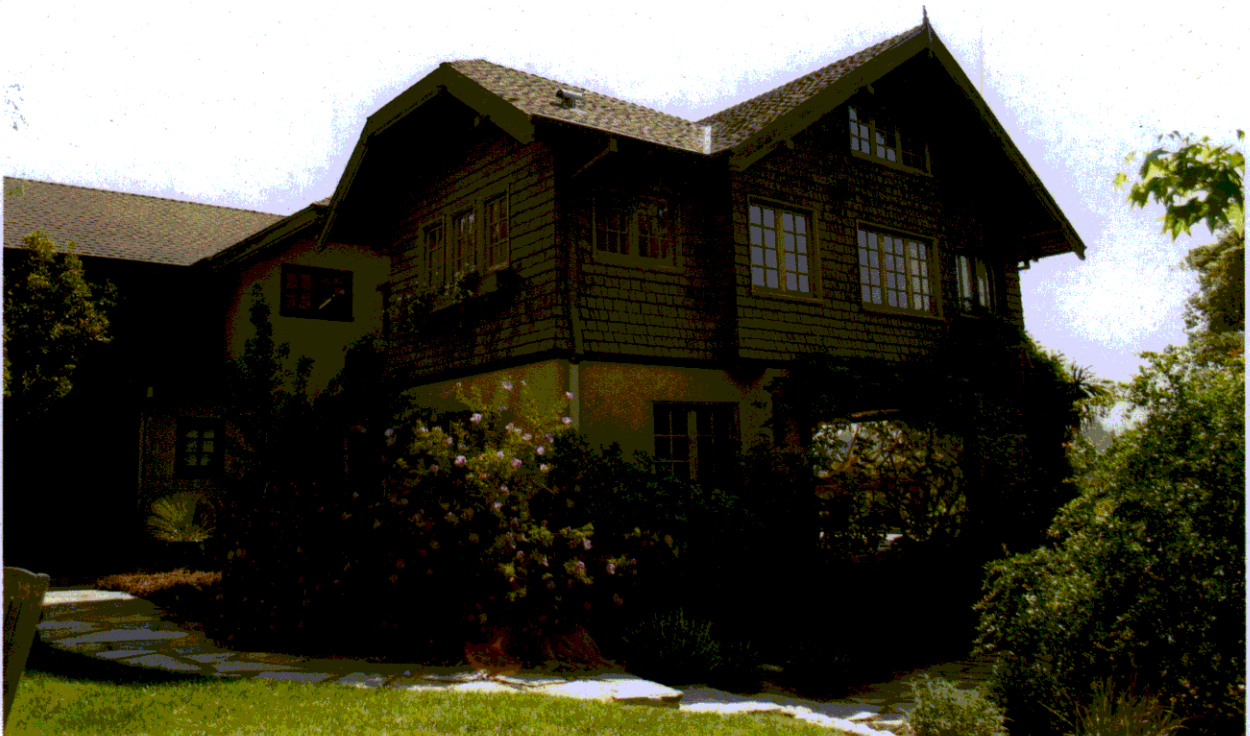
Front and West Facades (view SE)