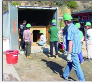
PERT training includes search and rescue

N OW MORE THAN EVER, PASADENA IS READY FOR ANY EMERGENCY. From our police officers and firefighters to our water and power and public works crews, every city department has a detailed plan in place to help Pasadena survive nearly any human-caused or natural disaster. Even our beloved Pasadena City Hall has reopened with some of the best seismic safety features you'll ever see. But that doesn't let residents off the hook! After a catastrophic, regional disaster, you and your neighbors may need to care for yourselves for up to 72 hours until help arrives. Be prepared with these tips: