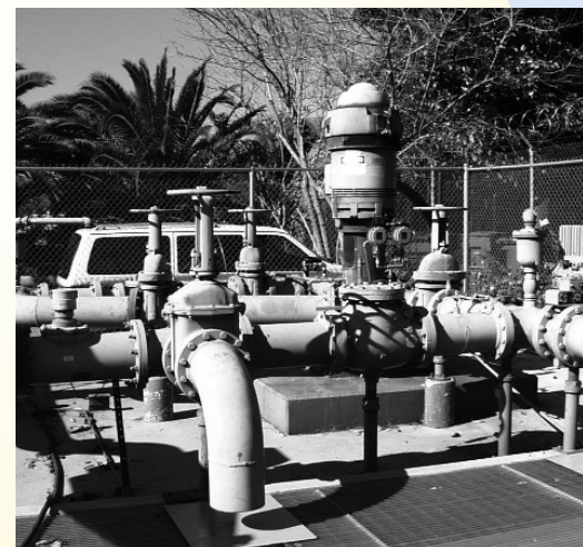
Sunset Reservoir Well

The oldest of these wells began operating in 1924. In the late 1990s the California Department of Health Services began issuing new regulatory standards for perchlorate, a component of rocket fuel, fireworks, explosives and road flares. PWP shut down four of the five wells because their perchlorate levels were too high to meet state standards.