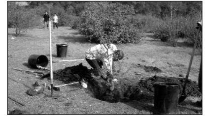
Replanting the Arroyo Seco

For more information or to lend a hand, call 744-4321.