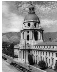
The current Pasadena City Hall was built in 1927

The City of Pasadena was incorporated in 1886. The first Pasadena City Hall was built at the northeast corner of Colorado Boulevard and Fair Oaks Avenue. Later, city offices shared space in a mercantile store.