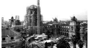
Pasadena City Hall was very well built for its time

There were no seismic building codes in the 1920s, and even the greatest engineers of the day did not possess the technical knowledge available today regarding the reaction of large buildings to earthquakes. Though incredibly well built for its time, Pasadena City Hall suffered serious damage in the 1991 Sierra Madre and 1994 Northridge earthquakes, and city officials learned it would not survive another major quake without partial or total destruction and serious injury and/or loss of life.