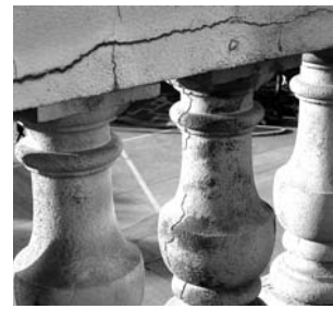
There were many other examples of severe damage

Your support is respectfully requested to help preserve and restore these historic elements.