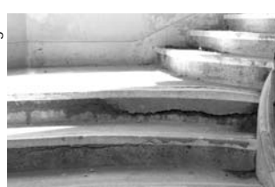
Stairwells were among the areas with significant earthquake damage

In autumn 2004, when the construction project went out to bid, a sharp escalation in building material costs forced the Pasadena City Council to streamline the project and move many of the finishing touches and high-level restoration work onto a list of unfunded priorities.