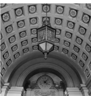
The barrel-vaulted ceiling in the grand entrance

Visitors experience a purposeful progression of exterior spaces as they enter Pasadena City Hall from Garfield Avenue, walk through the magnificent grand entrance with its barrel-vaulted ceiling and are embraced by the natural beauty of the courtyard.