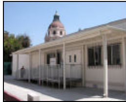
Modular Complex 280 Ramona St. (next to Permit Center)

City Clerk City Manager Finance Human Resources Human Services Information Technology Mayor Planning and Development Public Affairs Public Works Purchasing