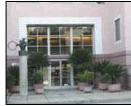
Walnut Plaza 215 N. Marengo Ave. (at Walnut)

Mail Services - Beginning Monday, August 2 Printing - Beginning Monday, August 9 Records Management