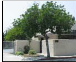
965 N. Fair Oaks Ave. (south of Robinson Park)

Beginning Monday, August 2 Cashier/Municipal Services City Hall Seismic Project Licenses Public Works Engineering Services/Permits Traffic Management Treasury Utility turn on/off