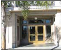
Chamber Building 117 E. Colorado Blvd. (near Arroyo Parkway)

Until the building reopens in 2007, here's where you can take care of your city business. Phone numbers have not changed.