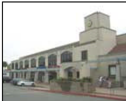
Fair Oaks Renaissance Plaza 665 N. Fair Oaks Ave., Second Floor (at Orange Grove)