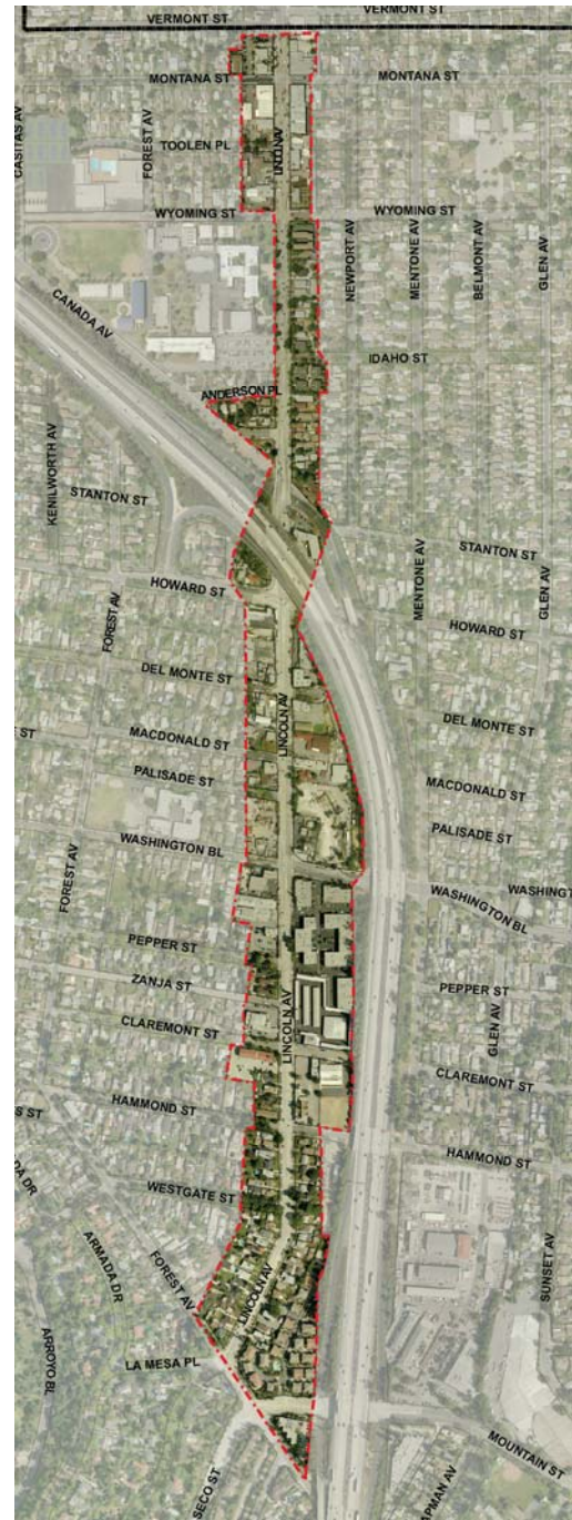
Lincoln Avenue Specific Plan Boundary

Four Lincoln Avenue focus group meetings were held in October and November 2009. The focus groups were asked to perform a “SWOC” analysis to describe the Strengths, Weaknesses, Opportunities, and Concerns they saw on Lincoln Avenue. Specifically, the groups were asked to think about: