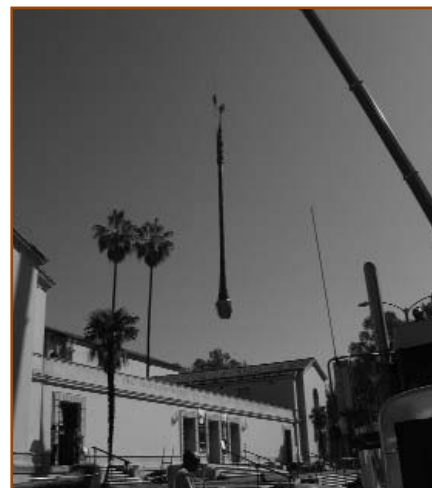
Three Mexican Fan Palms were planted to restore the original palm quantities.

In celebration of their centennial and as a thank you gift to the City of Pasadena, Pasadena Polytechnic School has partnered with the City and the Pasadena Public Library Foundation to fund the restoration of the Central Library landscaping. The project restored the original character of the landscaping as designed by Myron Hunt and Florence Yoch in 1927. Polytechnic students and families further gave back to their community by hosting a "planting day" at the Library on April 21.