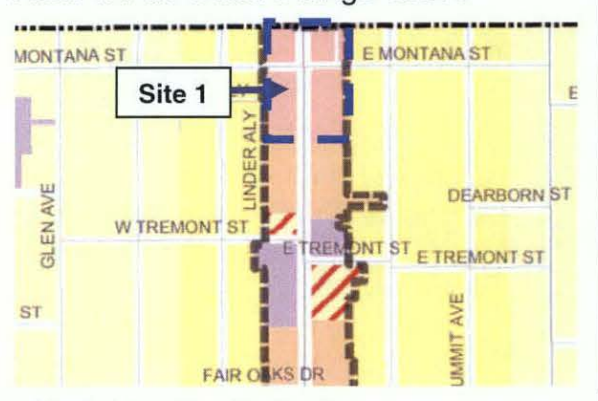
Area 4: Fair Oaks/Orange Grove

Requested Amendment: Low Mixed-Use to allow 32 du/ac (submitted by community stakeholder)