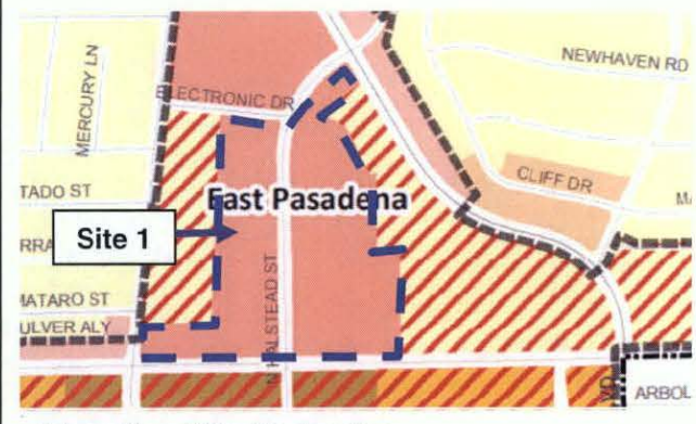
Area 3: East Pasadena

Requested Amendment: High Mixed-Use to allow 87 du/ac (submitted by Playhouse Village Association)