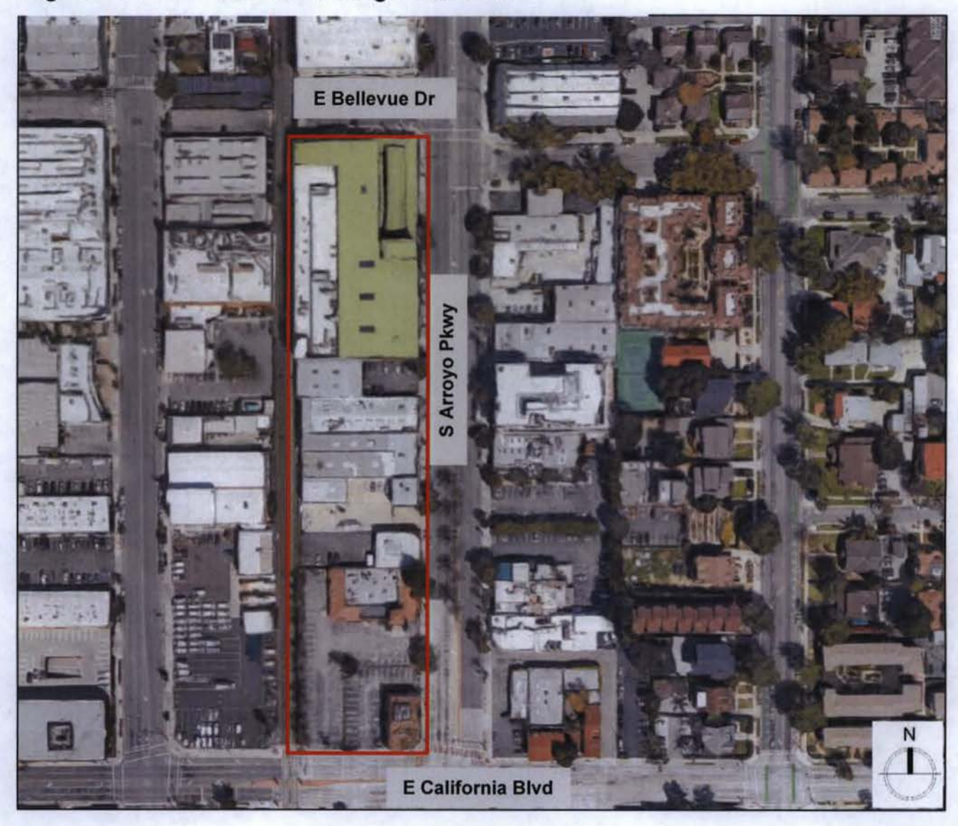
Figure 1: Aerial View and Existing Conditions

491-577 S Arroyo Pkwy PPR December 16, 2019 Page 3 of 9