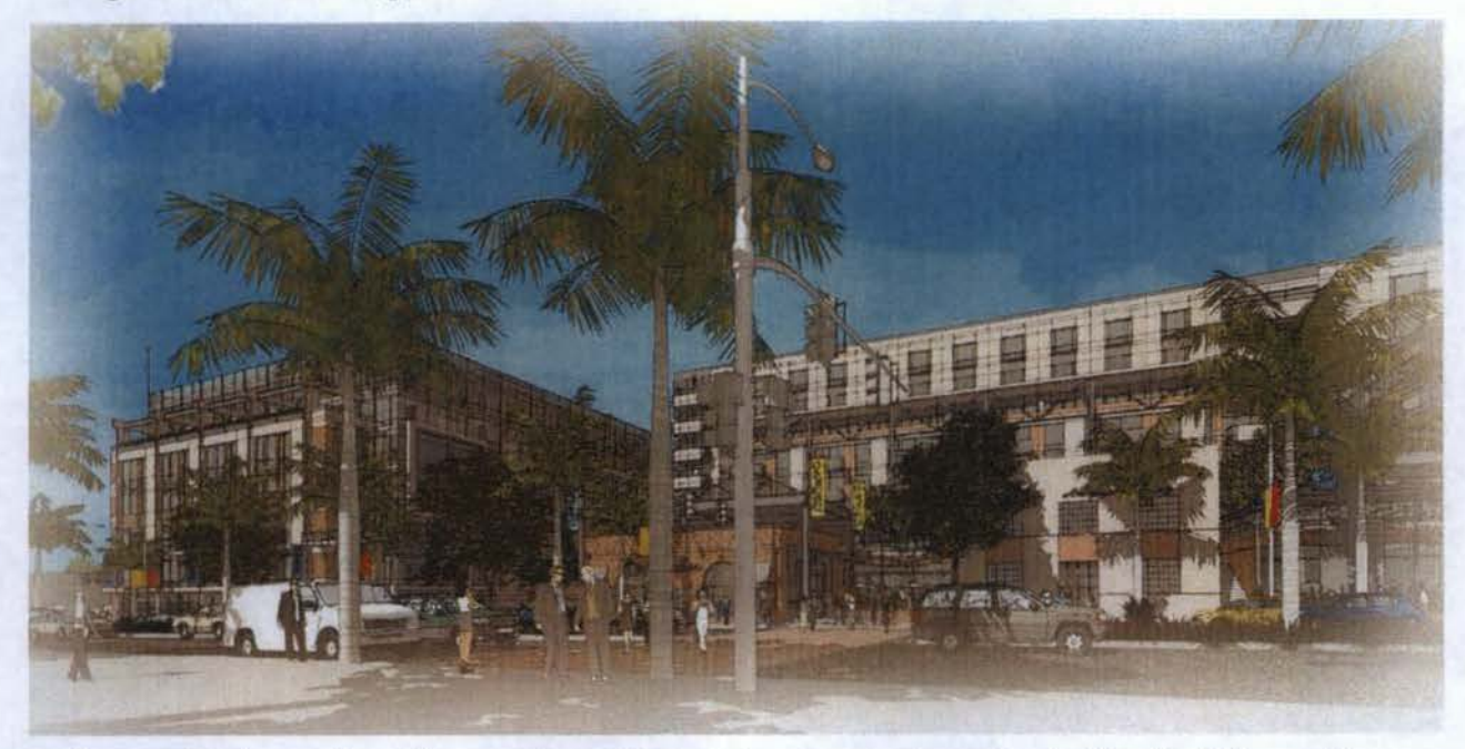
Arroyo Parkway: Looking southwest towards proposed medical office building, with assisted living facility in the background.