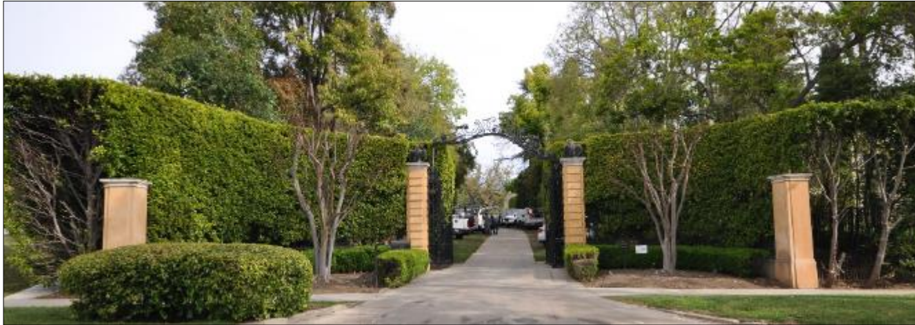
Pilasters, gates & driveway

Planning & Community Development Department