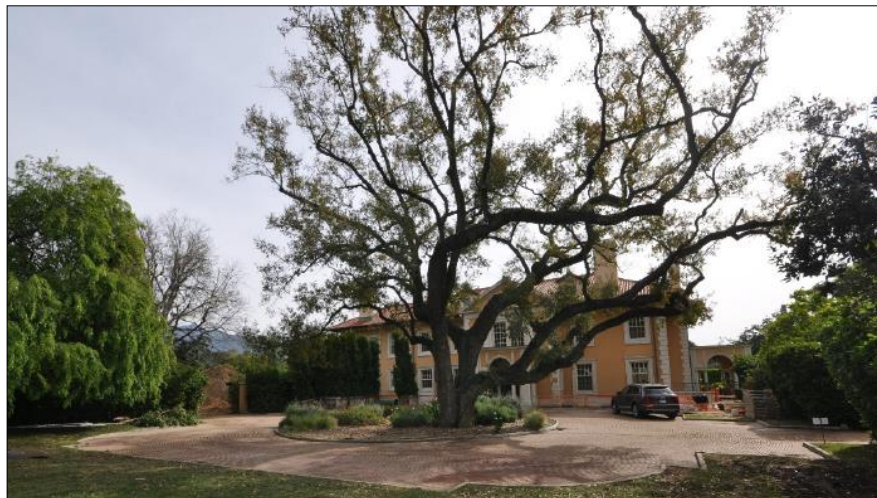
Driveway, planter & oak tree