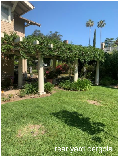
rear yard pergola