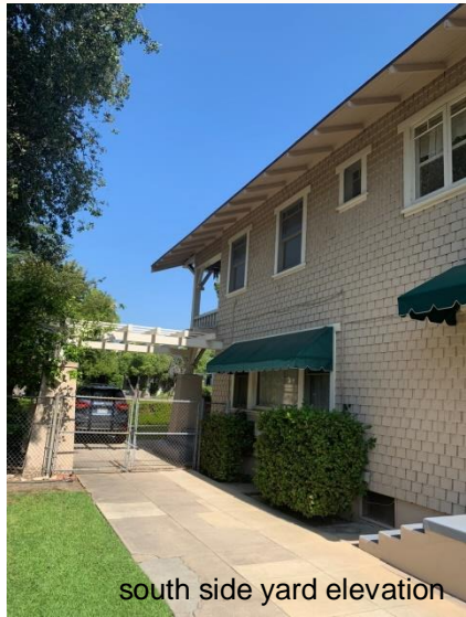
south side yard elevation

Planning & Community Development Department