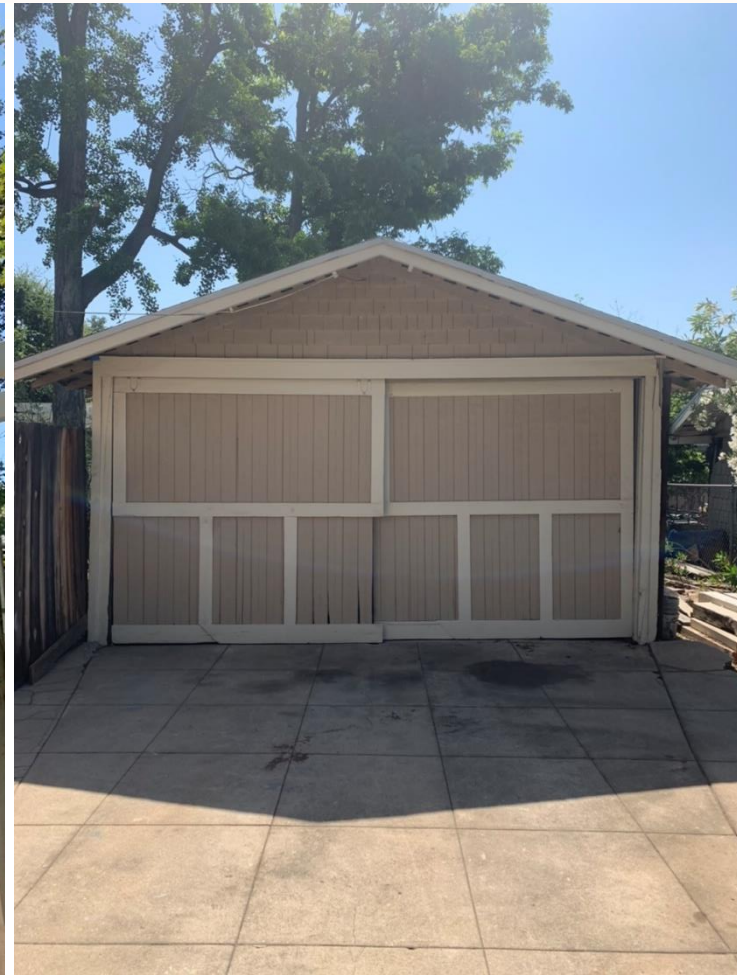
detached rear yard garage