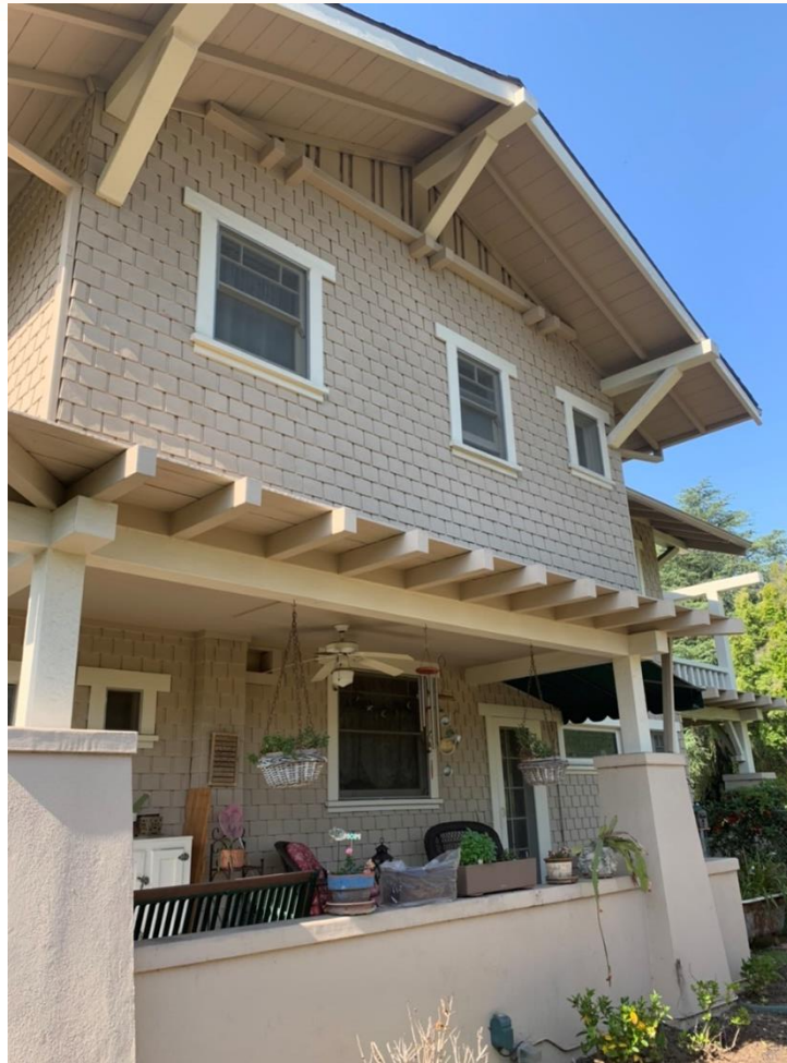
north side yard elevation