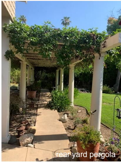
rear yard pergola

Planning & Community Development Department