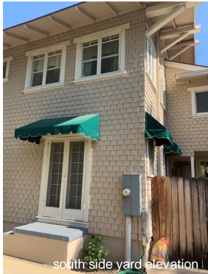
south side yard elevation