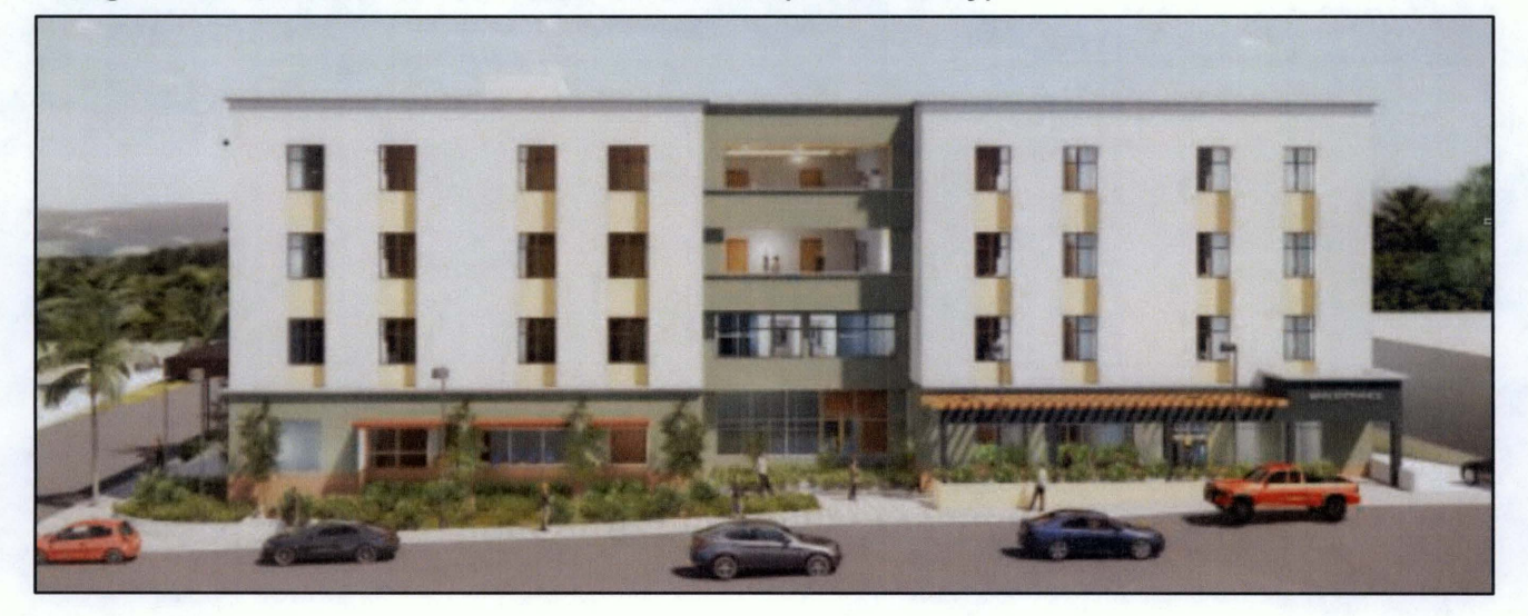
Figure 4: North Elevation: Walnut Avenue (Preliminary)

Figure 3: Typical Floor Plan (Floors 2 – 4)