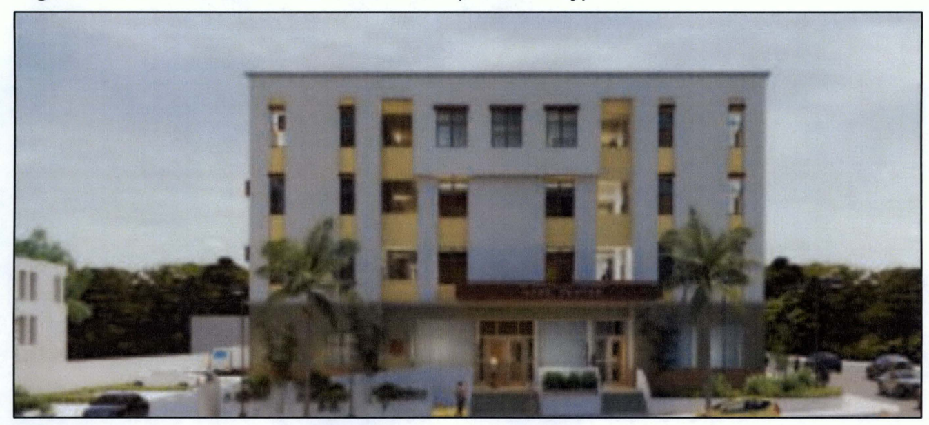
Figure 5: East Elevation: Catalina Avenue (Preliminary)

1000 E. Walnut Avenue PPR May 4, 2020 Page 5 of 8