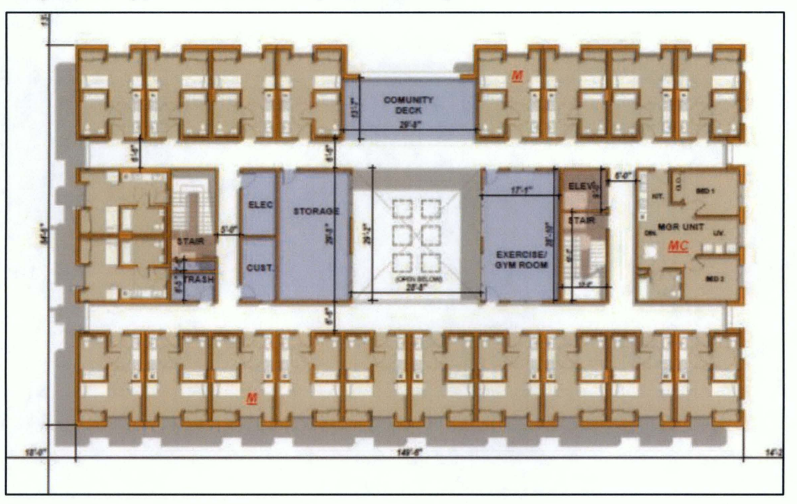
Figure 3: Typical Floor Plan (Floors 2 – 4)

1000 E. Walnut Avenue PPR May 4, 2020 Page 4 of 8