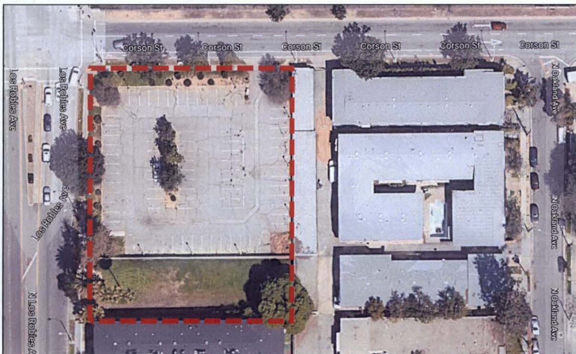
Figure 1: Aerial View Project Site