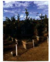
PODOCARPUS ELONGATUS "ICEE BLUE" 36" BOX