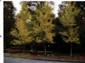
GINKGO BILOBA MALE CULTIVAR "PRINCETON SENTINEL" 36" BOX