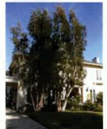
MELALEUCA QUINQUENERVIA 36" BOX