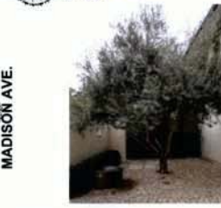
OLEA EUROPAEA "SWAN HILL" FRUITLESS OLIVE 36" BOX