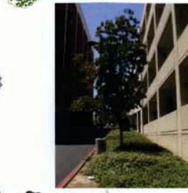
HYMENOSPORUM FLAVUM SWEET SHADE TREE 36" BOX