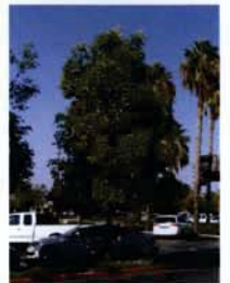
LOPHOSTEMON CONFERTUS SYN. TRISTANIA CONFERTA 36" BOX

STRUCTURE ADVANCED ARCHITECTURE 100 GRAND VIEW LOS ANGELES, CALIFORNIA 90008 TELEPHONE (310) 740-7969 FAX (310) 740-7969 E-MAIL HR@STRUCTURE.COM WWW.STRUCTURE.COM Consultant CARTER ROMANEK Landscape Architects, Inc. 28720 Roadside Drive, Suite 100 Agoura Hills, California 91301 (310) 477-3900