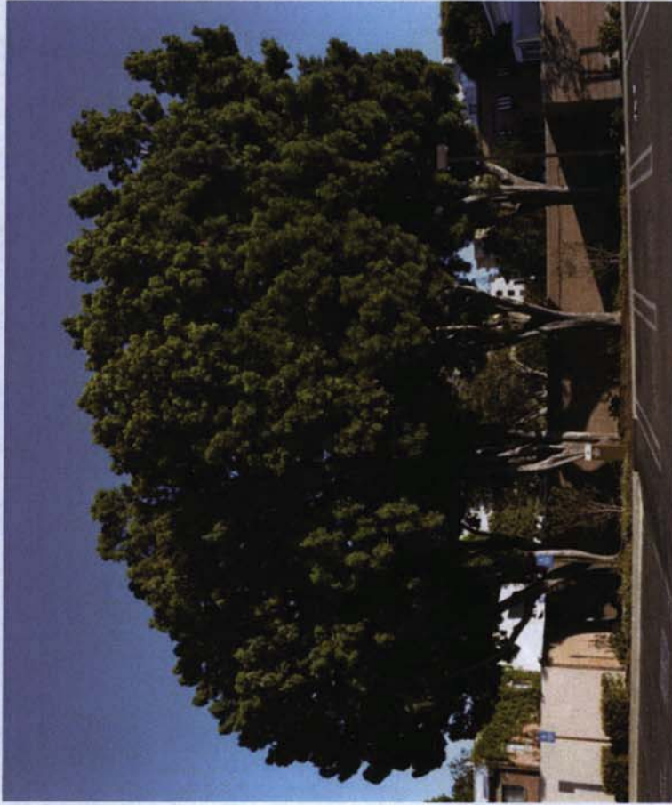
Afrocarpus gracilior , Fern pine tree