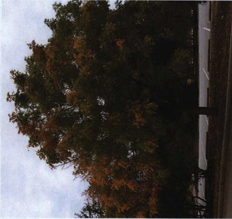
Pistacia chinensis , Chinese pistache tree