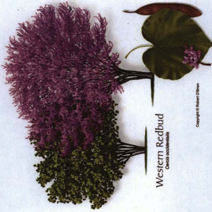
Western Redbud Cercis occidentalis