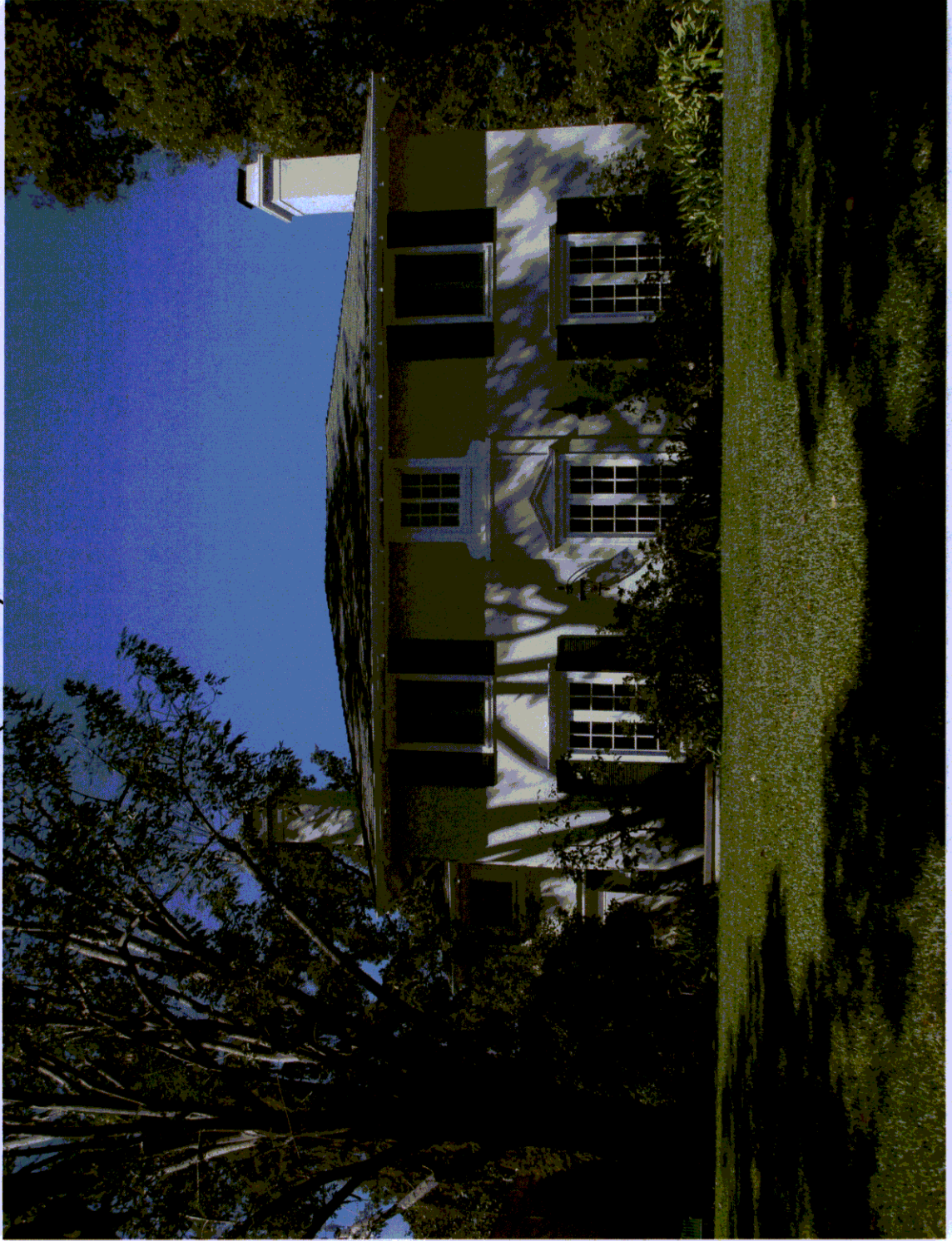
817 S. Madison Ave. East (Street) Elevation