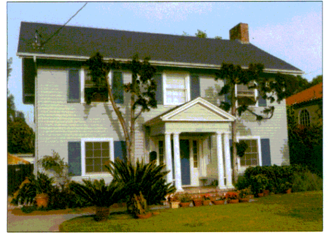
620 S. Mentor Avenue (1915)