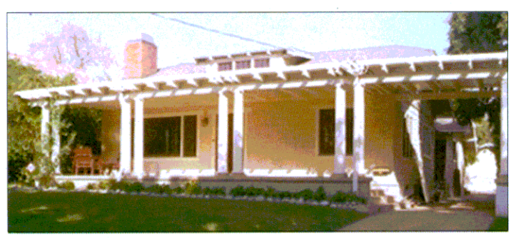
1120 N. Chester Avenue (1915)