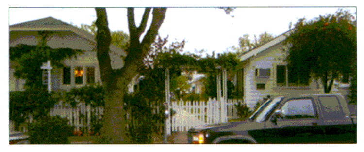
Colonial Court, 291 N. Garfield Avenue (1915)