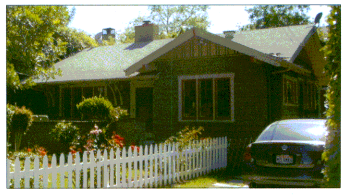
609 S. Hudson Avenue (1915)