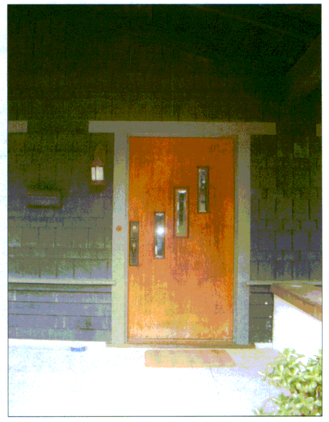
Front door, facing south