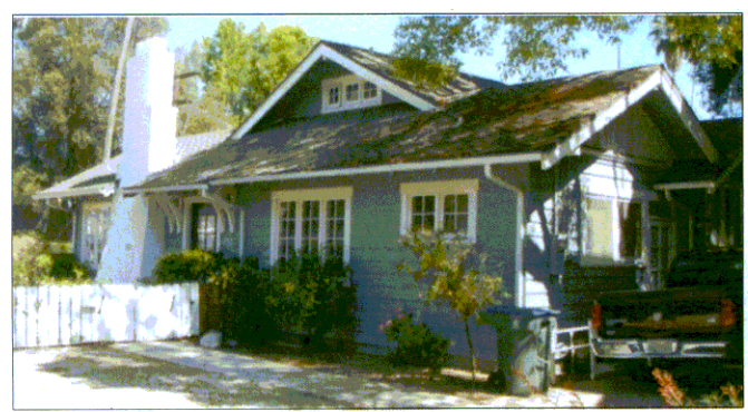
792 E. California Blvd. (1915)