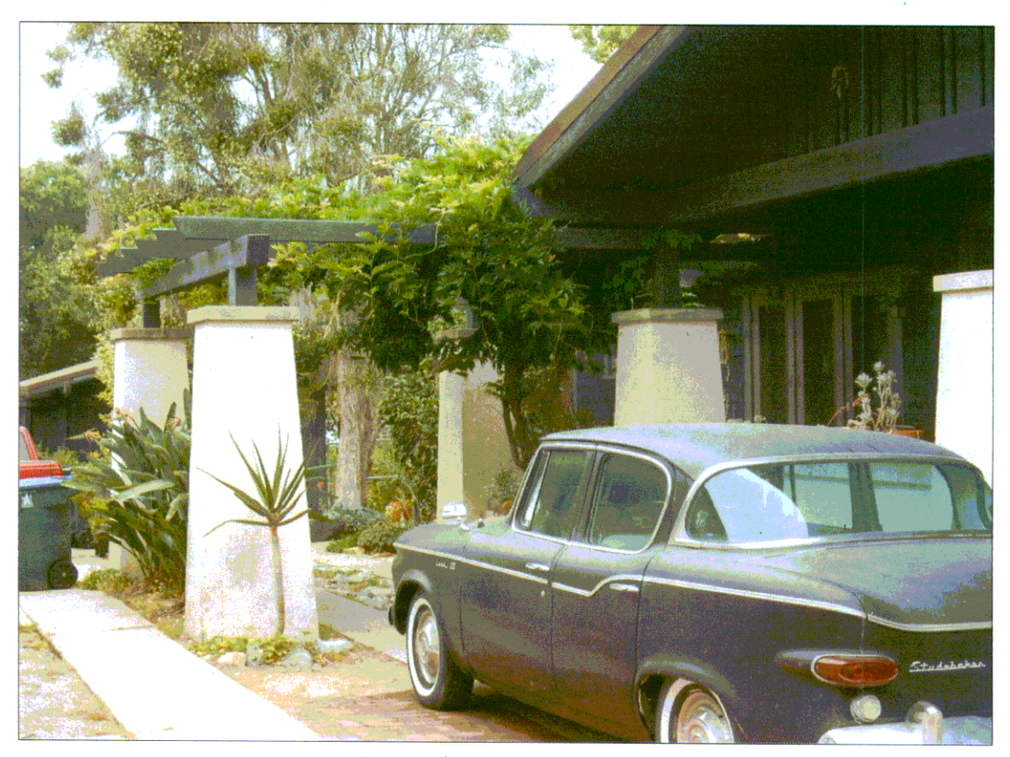
Porte cochere; from driveway, facing south