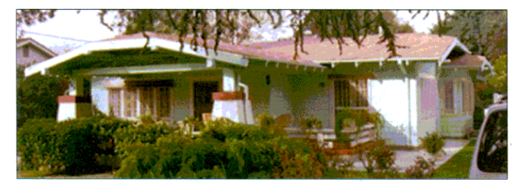
967 N. Chester Avenue (1914)