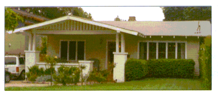
1109 N. Wilson Avenue (1914)