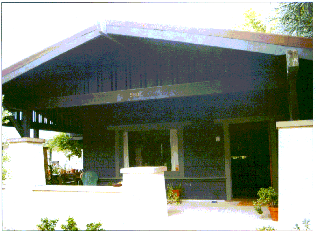
Primary street-facing gable; from front yard, facing south