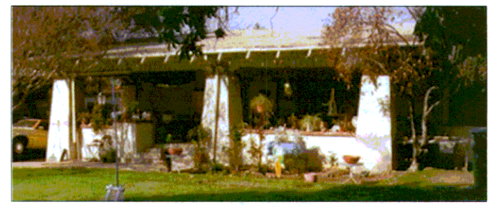
1053 N. Chester Avenue (1914)