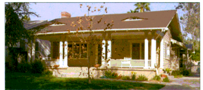
1036 N. Chester Avenue (1914)