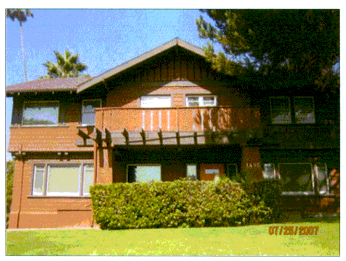
1495 N. Lake Avenue (1914)