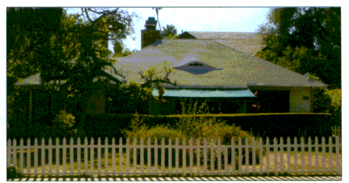
601 S. Hudson Avenue (1915)