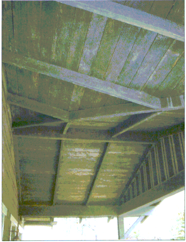
Exposed beams & rafters, facing southwest