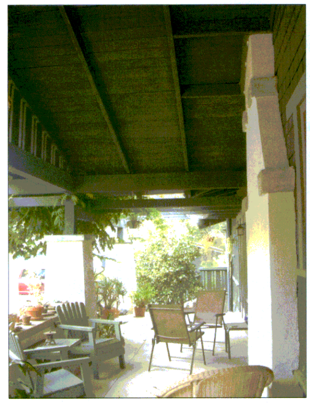
East side of front porch, facing south