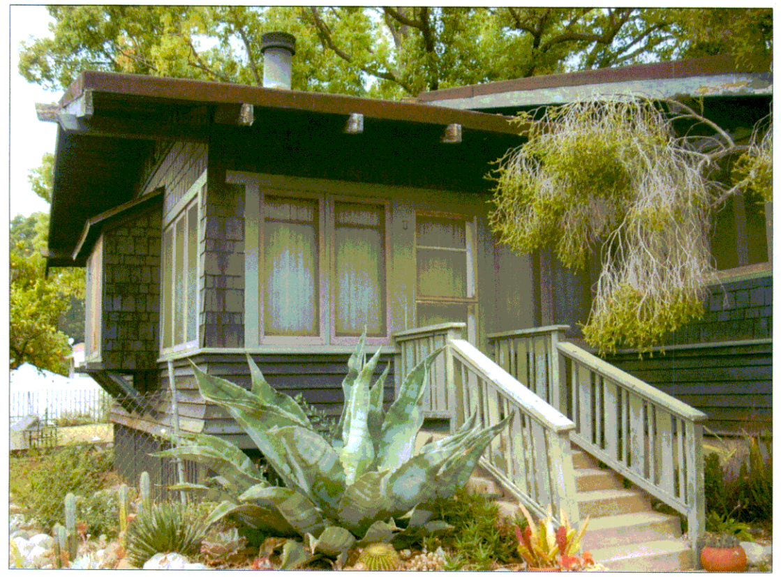
Southern portion of east elevation; from driveway, facing west