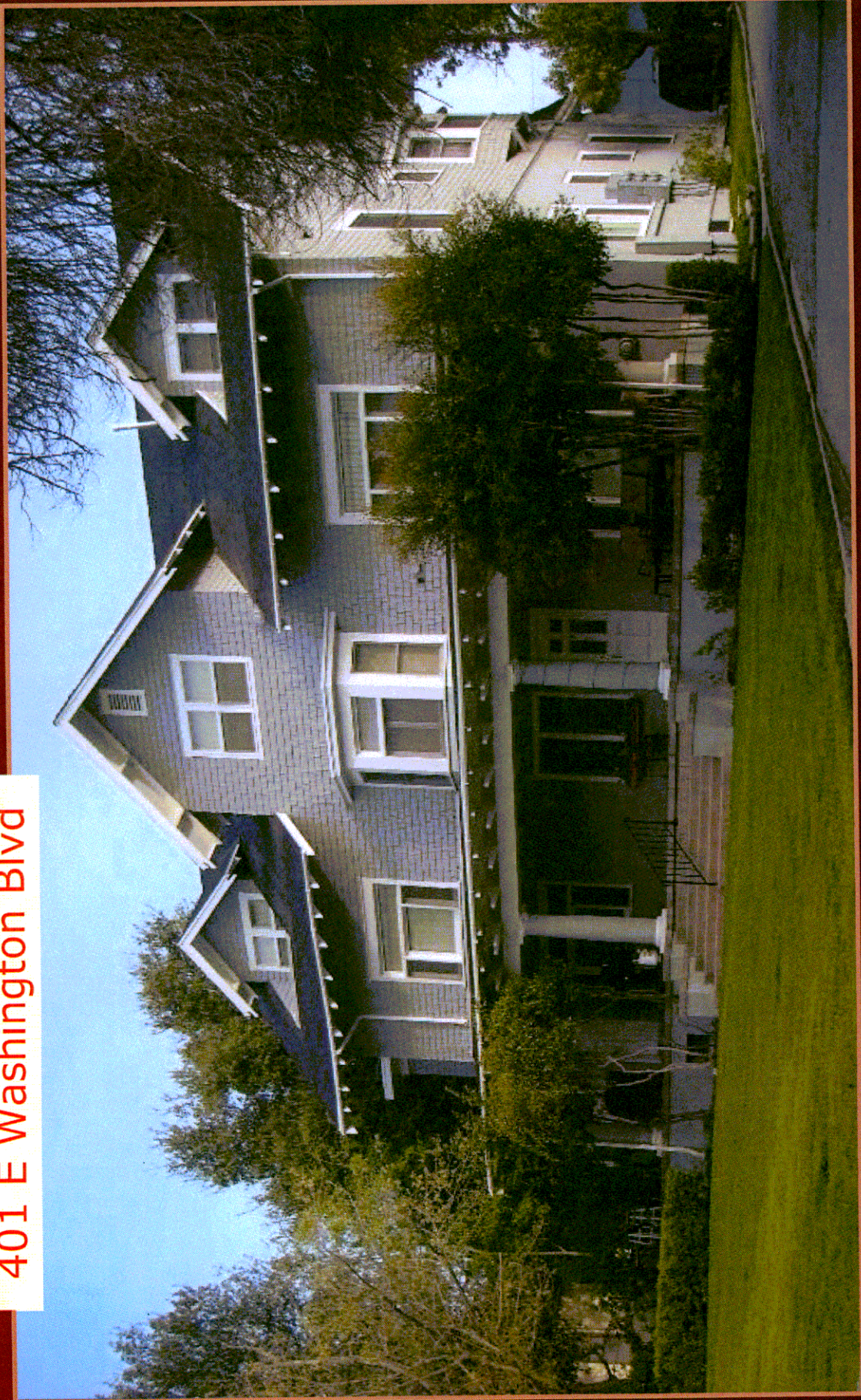
401 E Washington Blvd