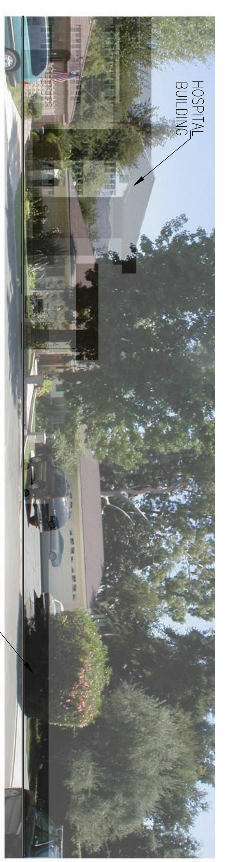
② SITE PLAN SECTION FROM EAST TO WEST (VIEW FROM DEL MAR BOULEVARD)