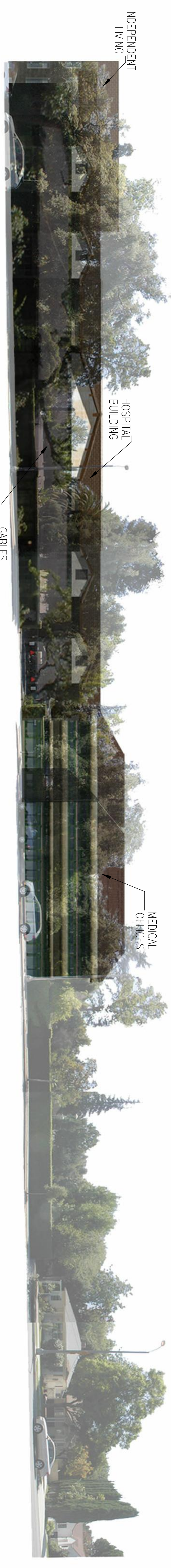
① SITE PLAN SECTION FROM EAST TO WEST (VIEW FROM DEL MAR BOULEVARD)