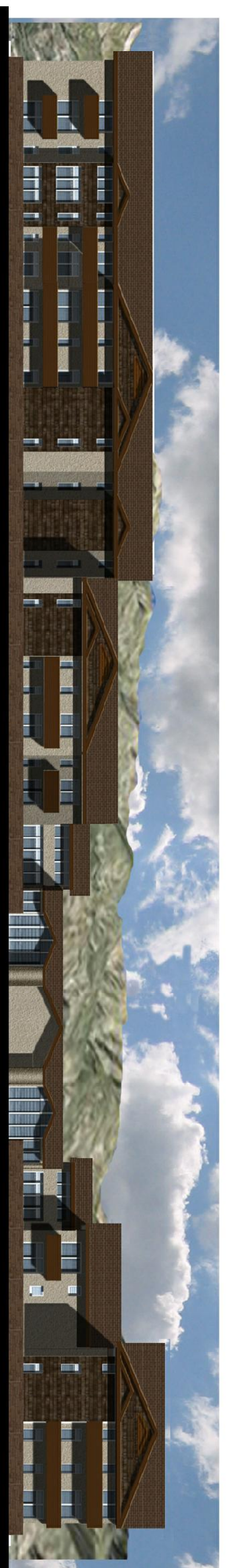
8 VIEW CORRIDOR C - (REPLICATED)