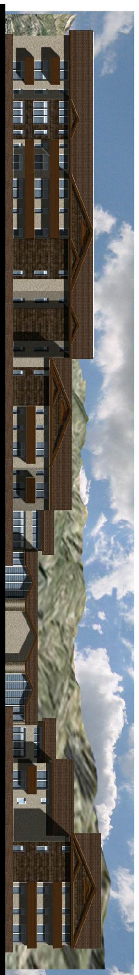
6 VIEW CORRIDOR A - (REPLICATED)