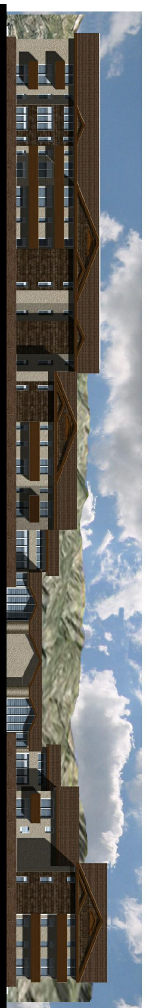
7 VIEW CORRIDOR B - (REPLICATED)