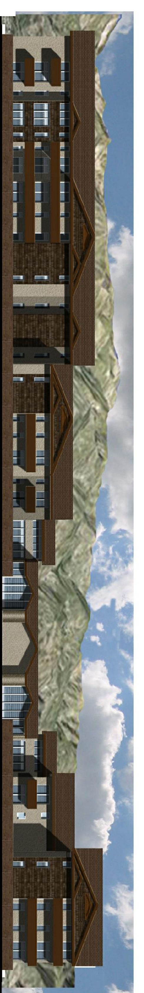
9 VIEW CORRIDOR D - (REPLICATED)

MORSE - BOUDREUX ARCHITECTS 1901A Newport Boulevard Costa Mesa, CA 92627 TEL: 714.251.5071 FAX: 714.251.5073