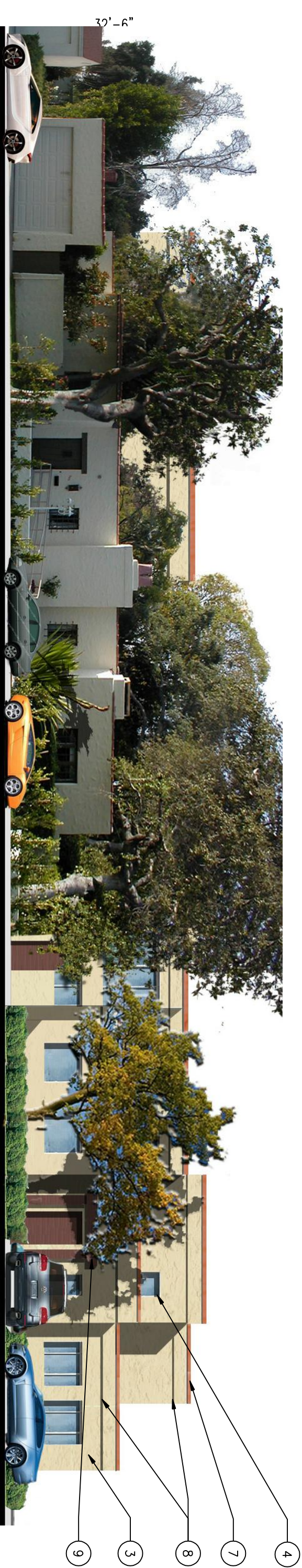
PROPOSED ASSISTED LIVING BUILDING ( BLDG. ) EAST ELEVATION