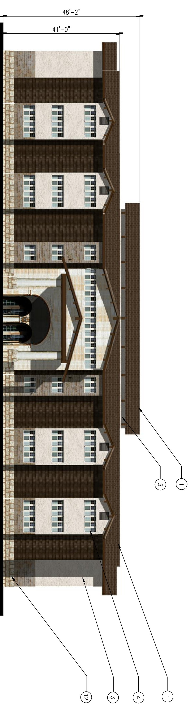
PROPOSED PSYCHIATRIC HOSPITAL BUILDING ( BLDG. ) SOUTH ELEVATION