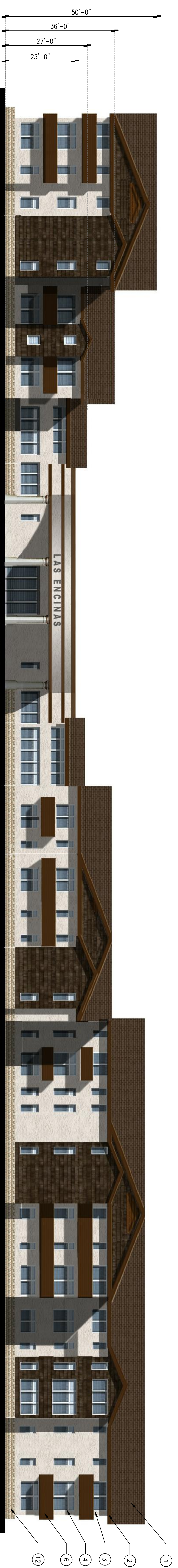
PROPOSED INDEPENDENT LIVING FACILITY BUILDING ( BLDG. ) SOUTH ELEVATION