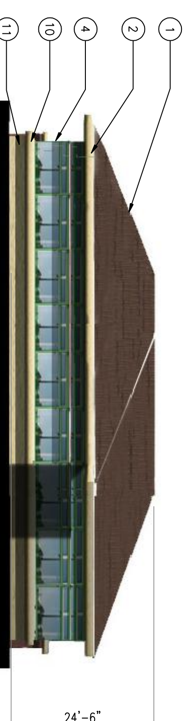
PROPOSED MEDICAL OFFICE BUILDING ( BLDG. ) NORTH ELEVATION