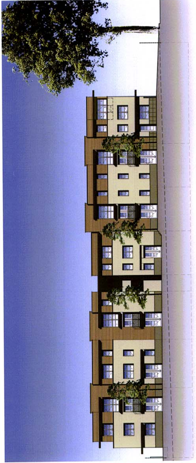
SOUTH EXTERIOR ELEVATION