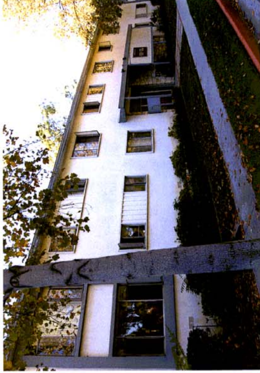
275 S. Marengo