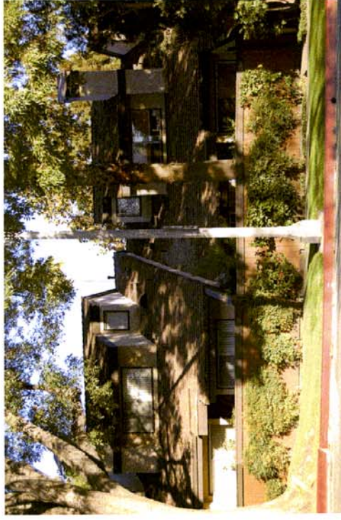
202-298 S. Marengo