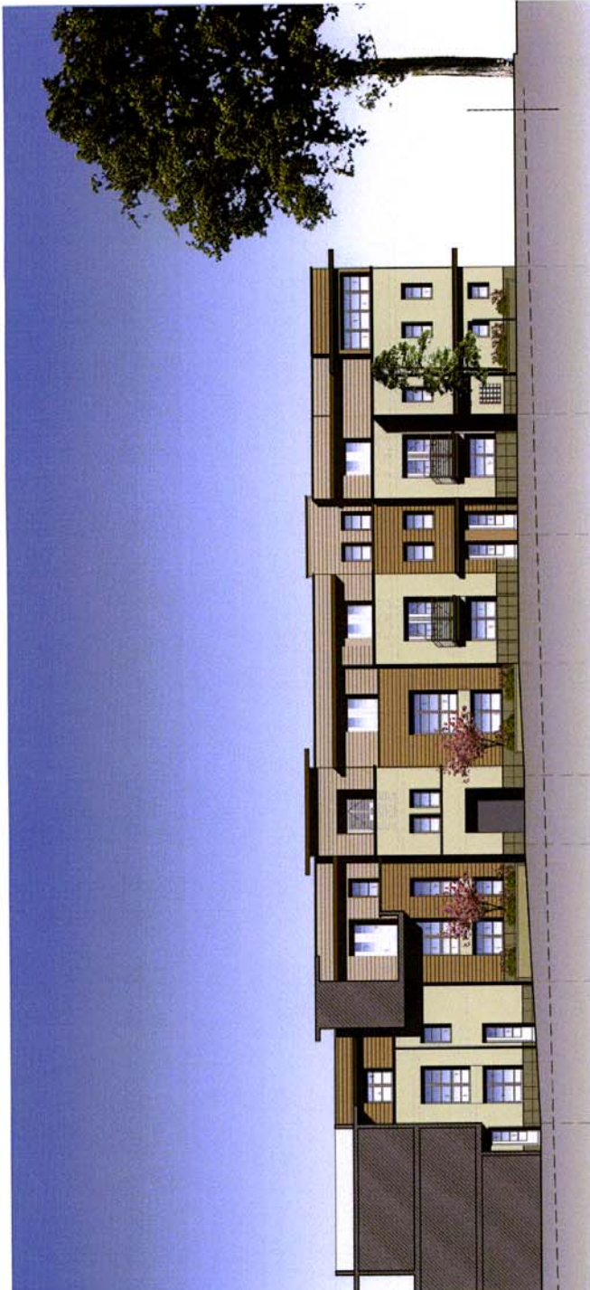
WITH COURTYARD ELEVATION