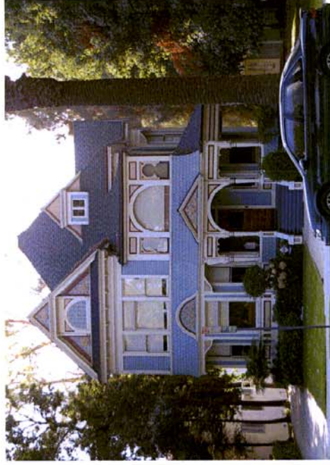
255 S. Marengo