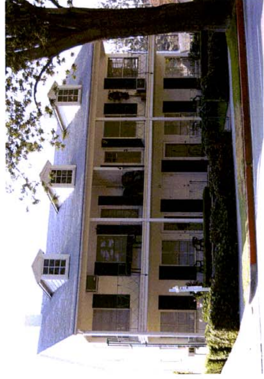
221 S. Marengo