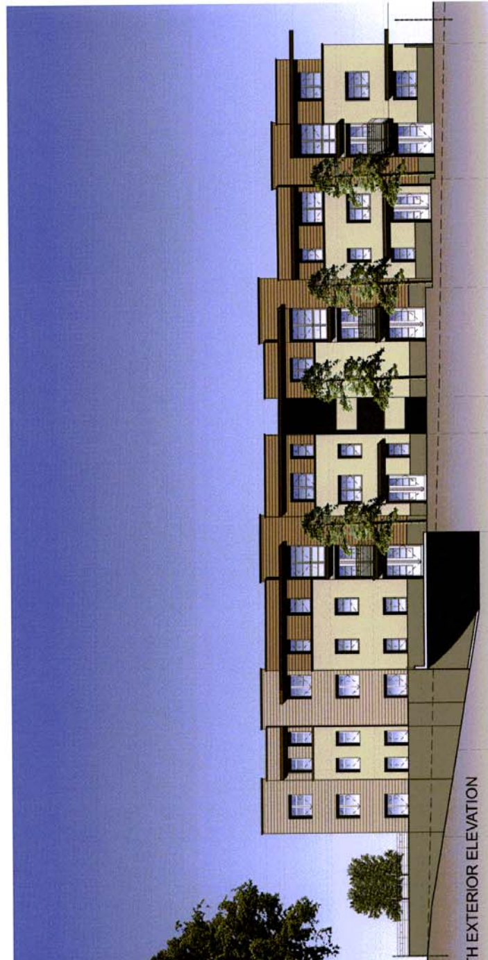
WITH EXTERIOR ELEVATION