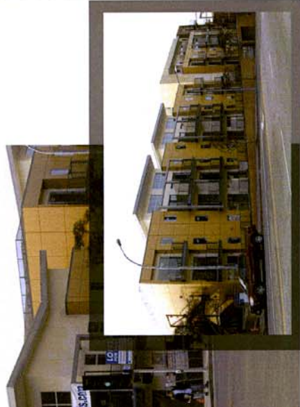
217 S. Marengo (Cordova Elevation)