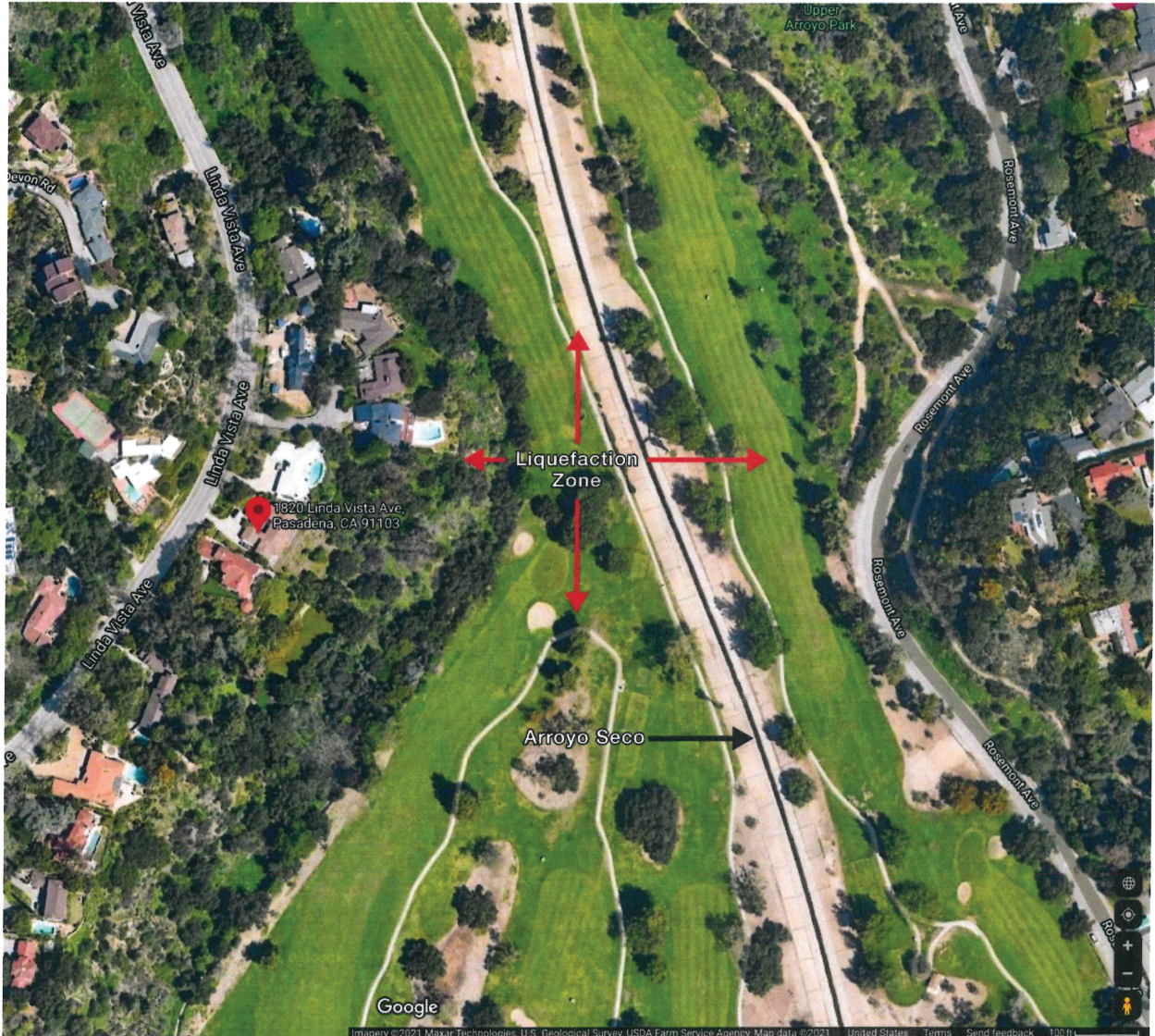
Exhibit A [Google Map Showing Subject Property With Annotations]